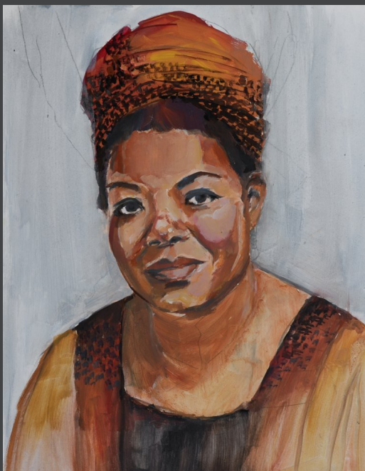
PAINTING OF MAYA ANGELOU BY ALLISON ADAMS ON DISPLAY SPRING 2019