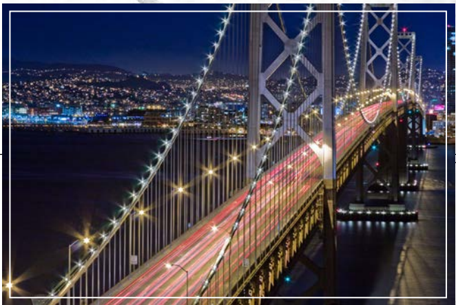
WHAT IF at PIER 26 there was an iconic hotel and park that lived under the Bay Bridge?