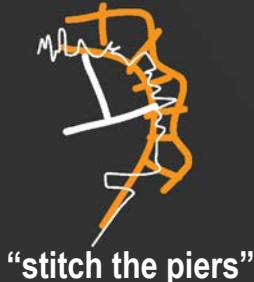
"stitch the piers"

Our concept is a cohesive vision of the piers as a continuous pedestrian waterfront promenade—a pier promenade! Interlaced with public uses: food, entertainment, culture, history, and the arts. We envision these uses at key piers along the waterfront, correlating with existing uses to establish thematic modes within the waterfront district. Pier 48 for food; Piers 26 + 28 under the bay bridge as hospitality and park; the Ferris wheel for Piers 30 + 32 next to the bridge; a museum at the Agriculture building; and the exemplar Piers 19 + 23 next to the Exploratorium as a cultural venue.