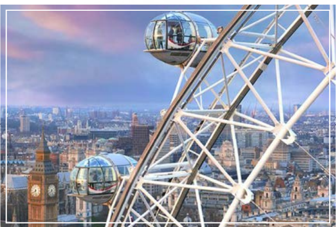
WHAT IF at PIER 30 + 32 there was a Ferris wheel to see the waterfront and city differently?

COIT TOWER THE EMBARCADERO PIER 19 + 23 CULTURAL NODE SAN FRANCISCO BAY