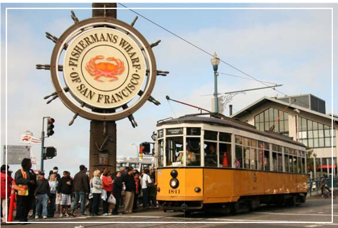
WHAT IF at PIER 48 there was a Fisherman's Wharf south?