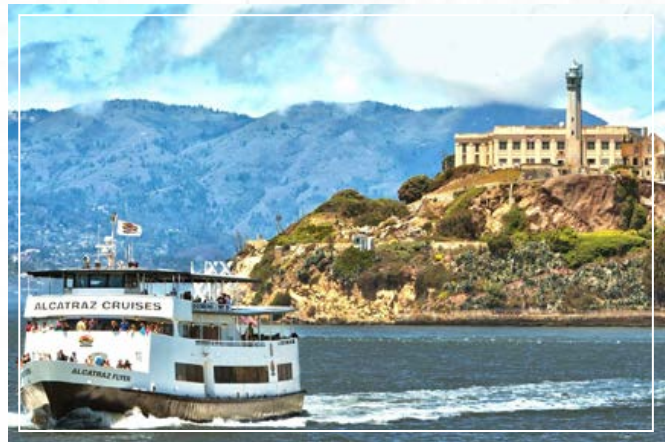
WHAT IF at the AGRICULTURE BUILDING there was a museum that reflected San Francisco's history?