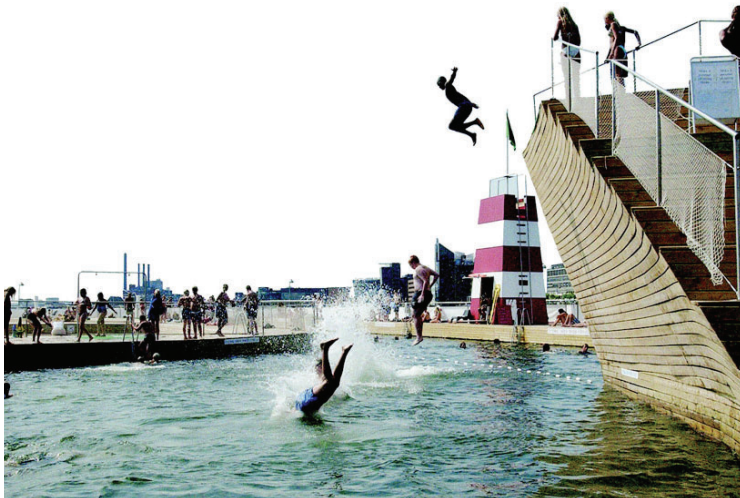
Copenhagen Harbor Baths (2003)