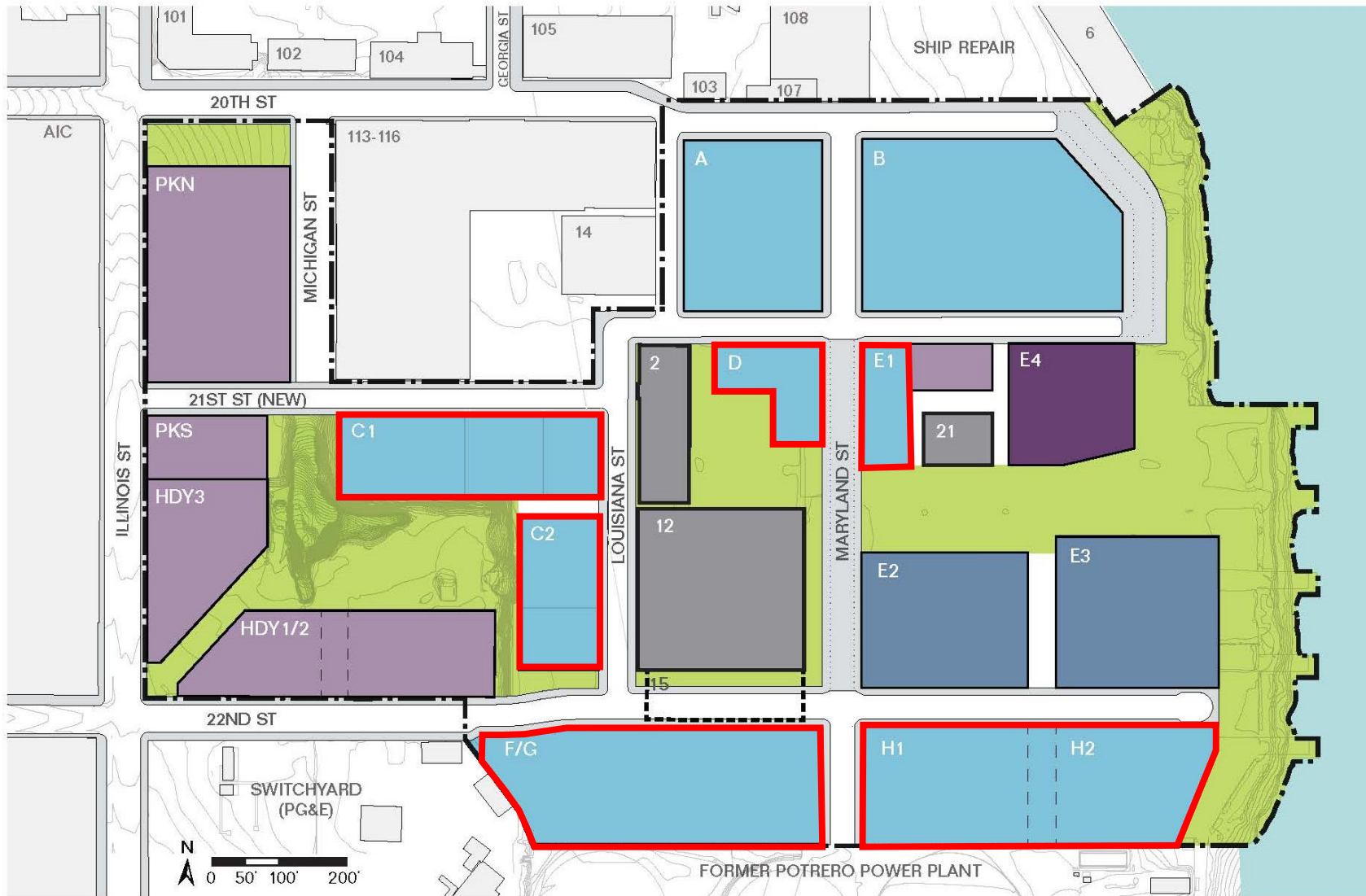
FIGURE 6.4.2: Building Height Maximum

Residential and Flex Parcels Impacted by D4D Amendment