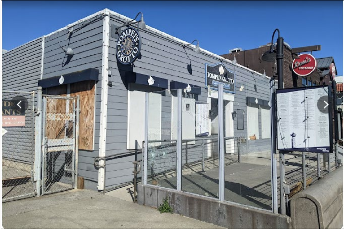
Exhibit 1: Site Location and Photo