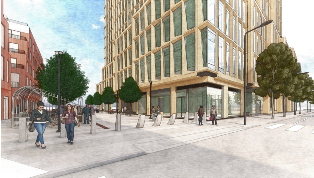
Illustration of Non-Standard Improvements, Bollards