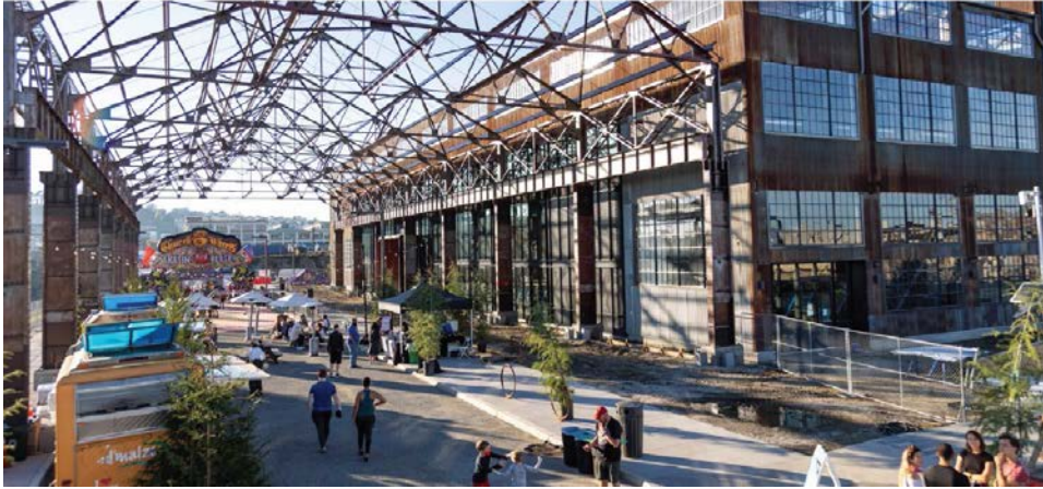
Cobbles and Custom Streetlights on 20 th Street