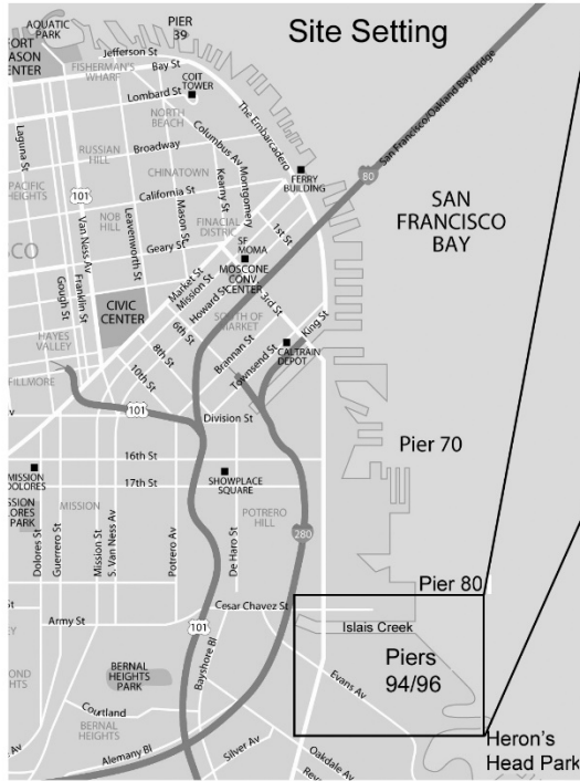
Figure 1, Site Location & Photos