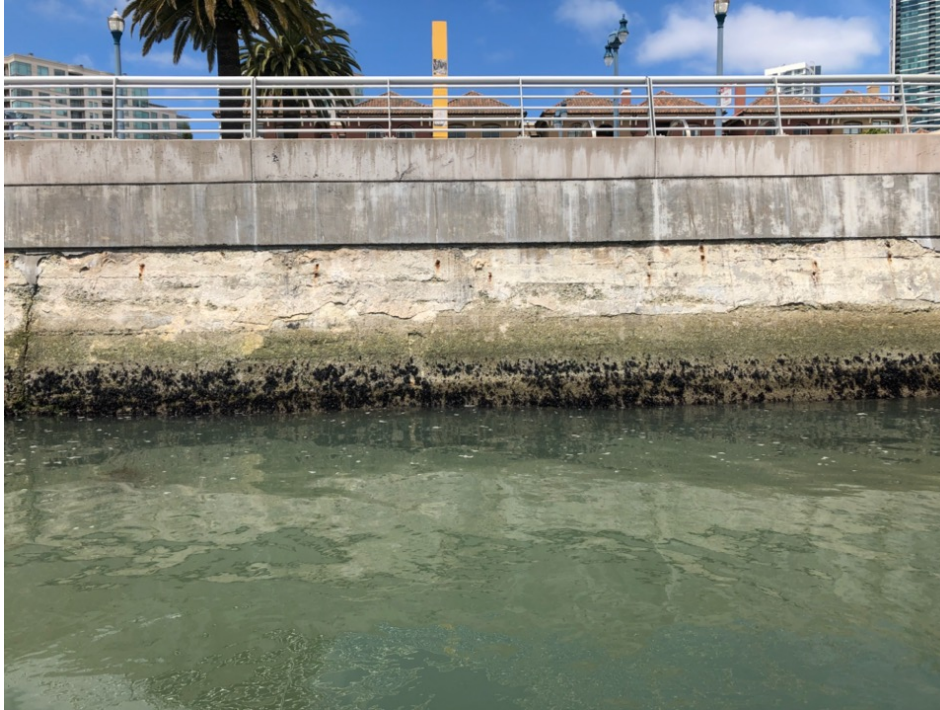
Figure 3: Example of Smooth Vertical Seawall Surface North of Pier 38

This project will provide key scientific information in support of that goal, with two main study objectives: 1) to experimentally determine whether the addition of three-dimensional structure and/or an admixture created to increase marine growth increase overall and native species richness and/or abundance, and 2) determine whether the effects of these modifications vary with tidal elevation, a gradient of wave exposure and salinity, or with scale of treatment (large vs. small panels).