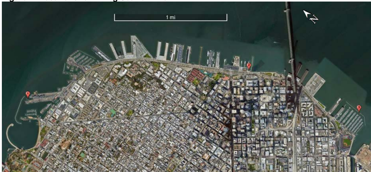
Figure 1: Locations for Living Seawall Pilot