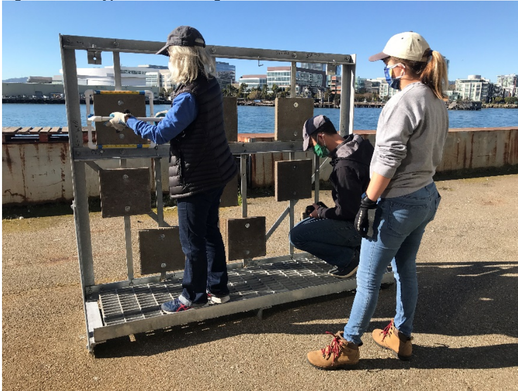
Figure 2: Prototype Frame Testing at Pier 50

SERC scientists will provide regular progress updates during the monitoring period and provide a final report describing their findings and results, including recommendations for elements that that could be incorporated within Waterfront Resilience Program projects. The final report will summarize the potential benefits to the Bay, including to native species, of incorporating admixture and textural elements within the seawall design and recommendations for additional pilot studies or design variations that could further benefit and improve habitat and ecosystem conditions. In addition to using data and information learned from this pilot study for Port projects, the information will be circulated to other agencies pursuing engineering with nature approaches along engineered shorelines in San Francisco Bay.