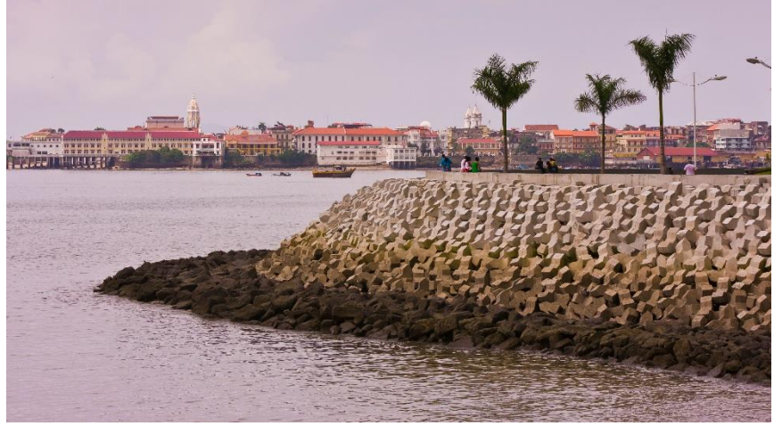
Seawall of riprap on Panama Bay - Panama City, Panama