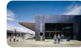
Pier 1 1/2

South Beach/China Basin Area: AT&T Park, South Beach Harbor