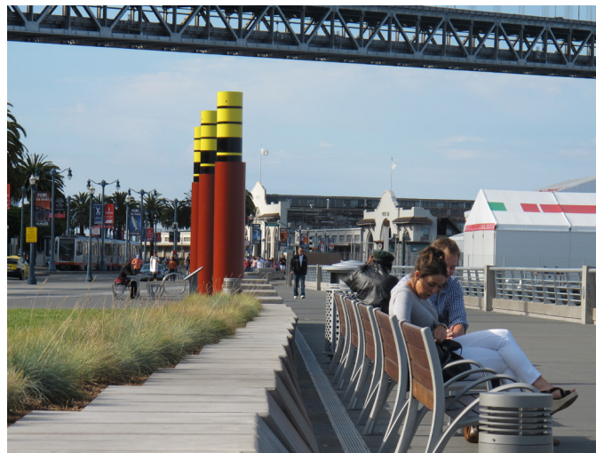
Brannan Street Wharf

These public parks, together with the Embarcadero Promenade, create a welcoming shared public space for the many pedestrians traveling along the waterfront. Often, however, these parks, particularly Brannan Street Wharf, are not heavily used. The public has called for Port parks to offer more active recreational play areas, events, and amenities, including food and public restrooms, to attract more people who will enjoy these areas and bring them to life. The Port will engage its stakeholders in an effort to identify options for improving activities and use of its public spaces. This effort will include evaluating partnering opportunities for park activation pilot projects, new strategies to consider in leases and developments on adjacent properties, and ways to provide complementary entertainment and attractions to enliven and increase public use of waterfront open spaces.