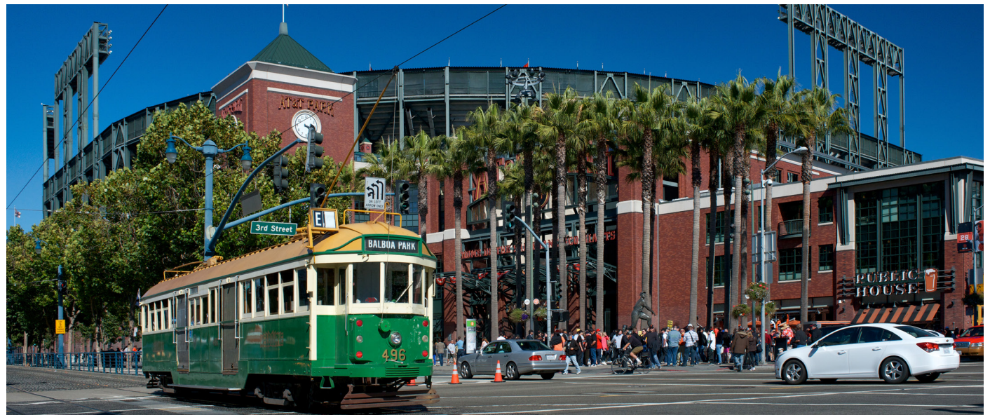
F Line historic streetcar at the ballpark

implementing pedestrian and bicycle improvements. The Port is supporting the SFMTA's Embarcadero Enhancement Project to provide a protected bicycle facility to improve safety for all modes, and an improved pedestrian experience along the Embarcadero Promenade from King Street to Fisherman's Wharf. This effort requires close coordination with the SFMTA to work with Port tenants and businesses to ensure that reasonable access and curb zone areas are preserved to support goods movement and loading. The Port seeks to minimize vehicle crossings over the Embarcadero Promenade into the piers wherever possible, while ensuring access required for maritime operations.