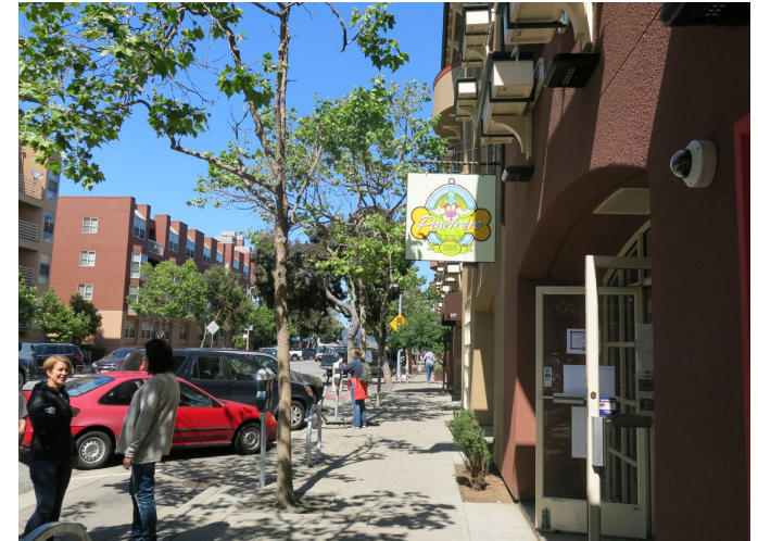
Rincon Hill neighborhood

At the same time, large entertainment and special events will need to be managed sensitively to balance public trust objectives with the legitimate quality-of-life needs of South Beach residents and other neighborhood stakeholders. The South Beach community, multiple City departments, the San Francisco Giants, and event sponsors invest significant time and resources in defining the details of the use or event and the commitment of staff and other resources to address good neighbor communications and practices. The Port will continue to work closely with the community, Port tenants and sponsors, City departments, and BCDC to support and improve these practices, including coordination with applicable good neighbor protocols administered by the San Francisco Entertainment Commission.