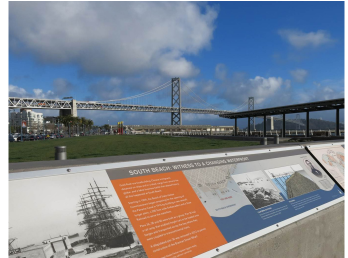
History plaque at Brannan Street Wharf

The National Trust for Historic Preservation has identified the Embarcadero Historic District as one of the most endangered historic places in the country due to seismic hazards, flood risks from rising tides, and the fragile condition of many of its historic resources. The 3 mile Embarcadero Seawall itself is a historic resource within the historic district. The Port's efforts to lead the Embarcadero Seawall Program focus on protecting regional transportation infrastructure, utilities, emergency assets, and businesses. These efforts will include strategies to preserve and enhance the resilience of the historic bulkhead and pier structures. This work will be complex and complicated. Improvements to the Seawall will likely involve various partnerships to support and leverage public and private investments. Properties along the South Beach waterfront will need to incorporate waterfront resilience improvements that also include other public benefits. The Port and the public will need to consider non-traditional approaches to historic preservation that allow for the innovation required to adapt to the impacts of climate change while respecting the history, character, and authenticity of the waterfront.