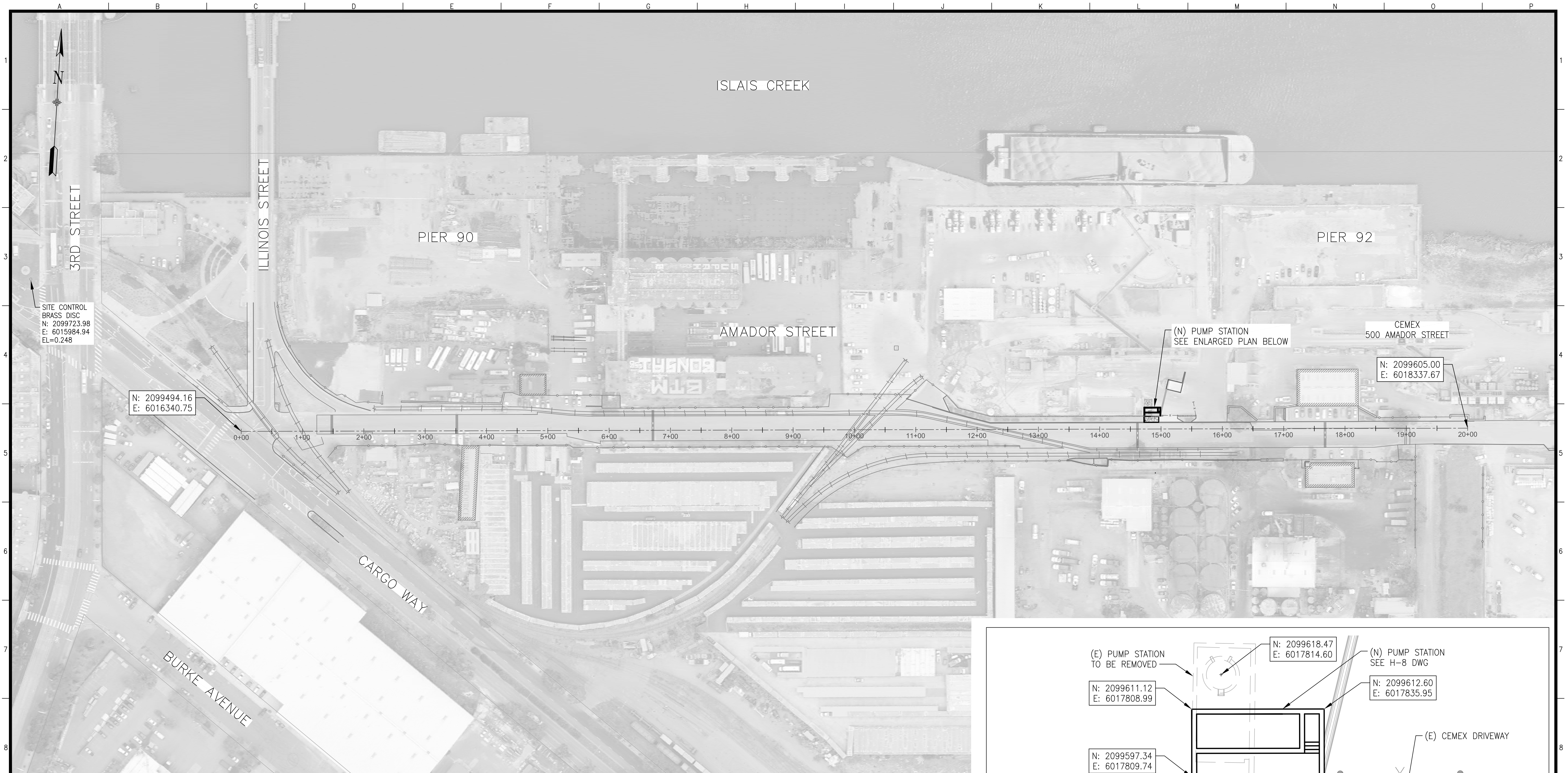
PLAN SCALE: 1"=80'