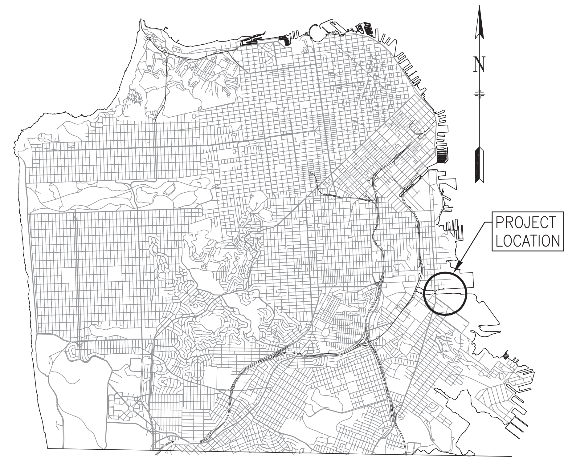
KEY MAP SCALE: NTS