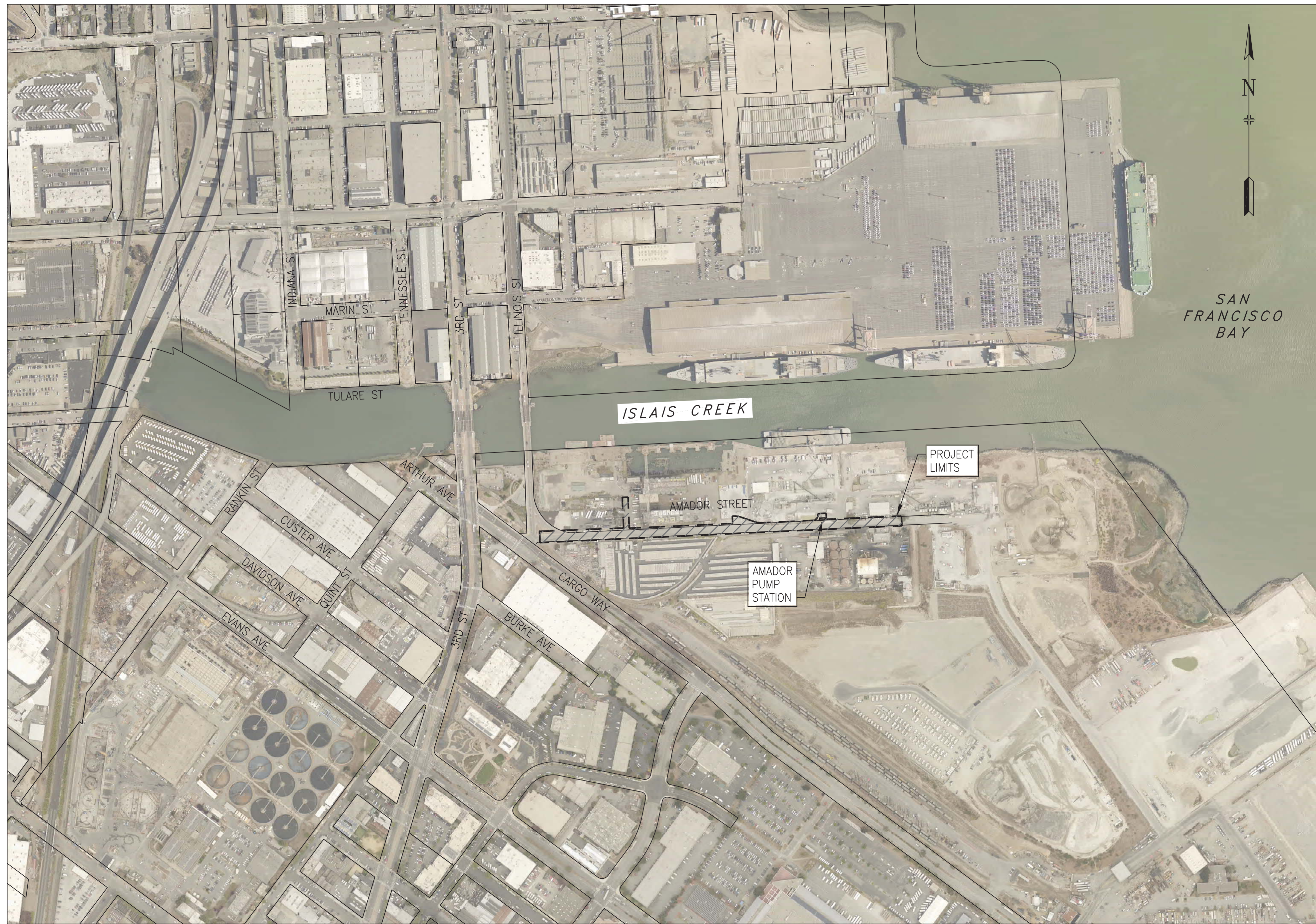
VICINITY MAP SCALE: NTS