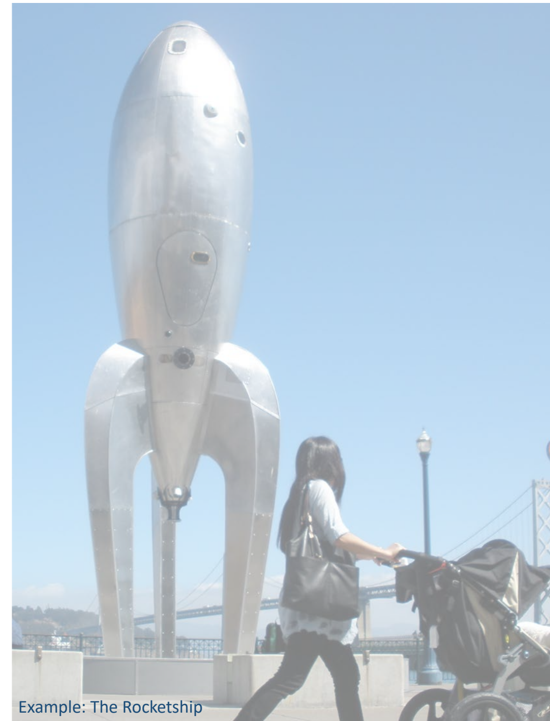
Example: The Rocketship