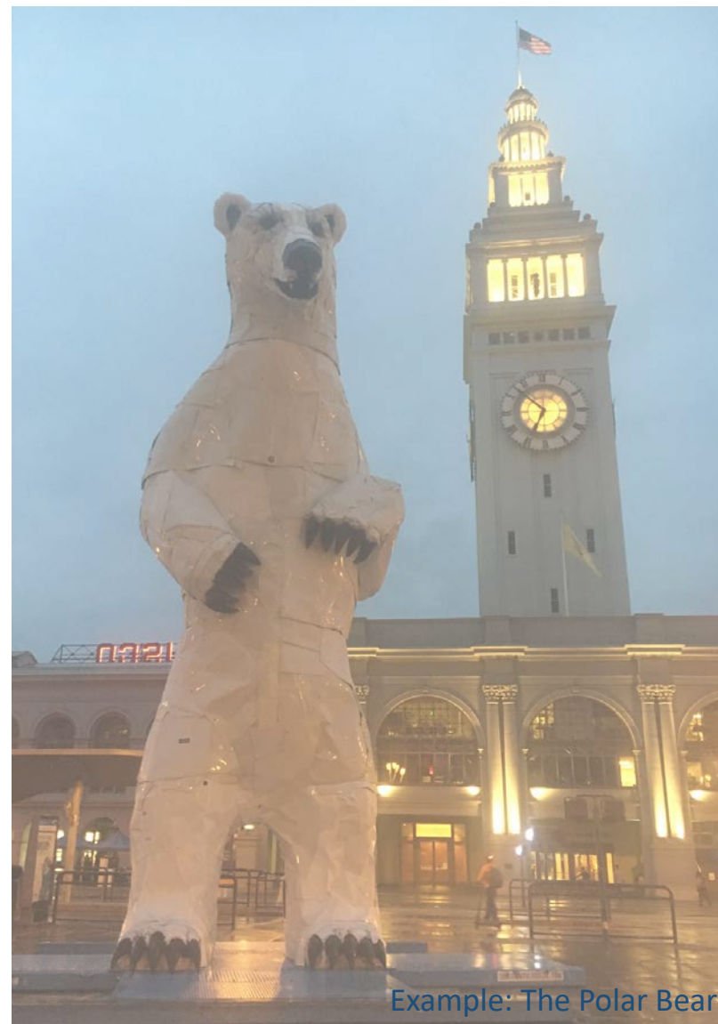
Example: The Polar Bear

Artist Sponsored or unsolicited proposals will be evaluated by Port staff up to 3 times a year or as directed by Executive Director.