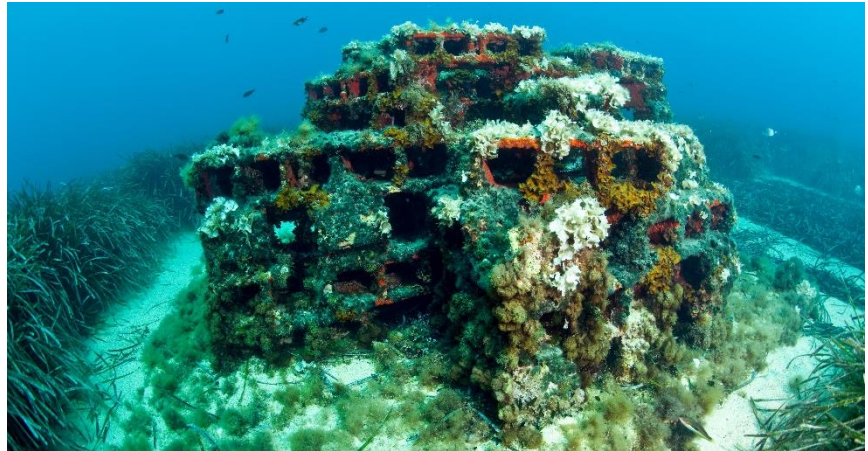
An artificial reef submerged in between the Posidonia oceanica bed - Larvotto Marine Reserve, Monaco