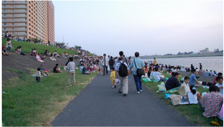
Edogawa Firework