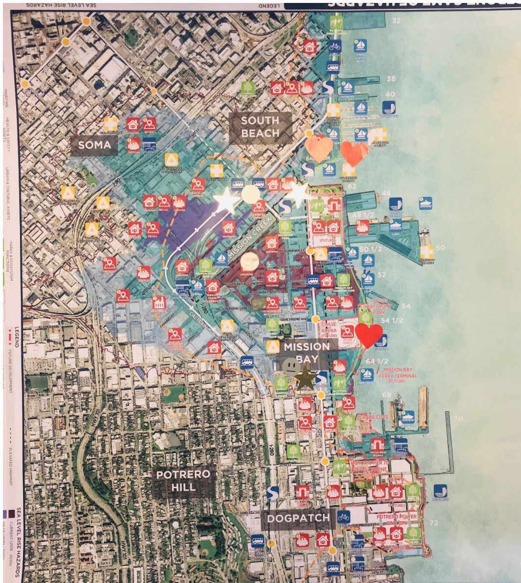
TABLE #2 GAMEBOARD