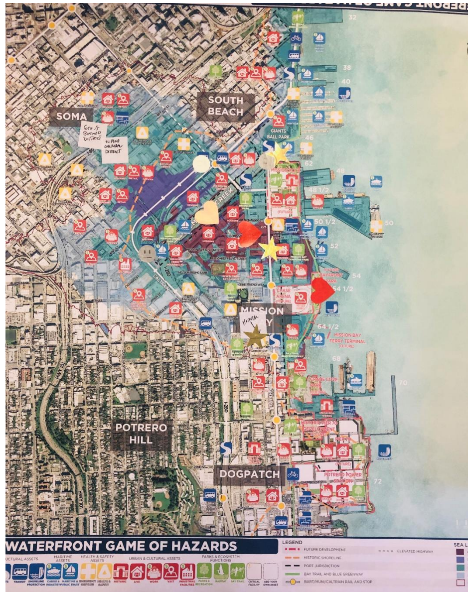
TABLE #3 GAMEBOARD