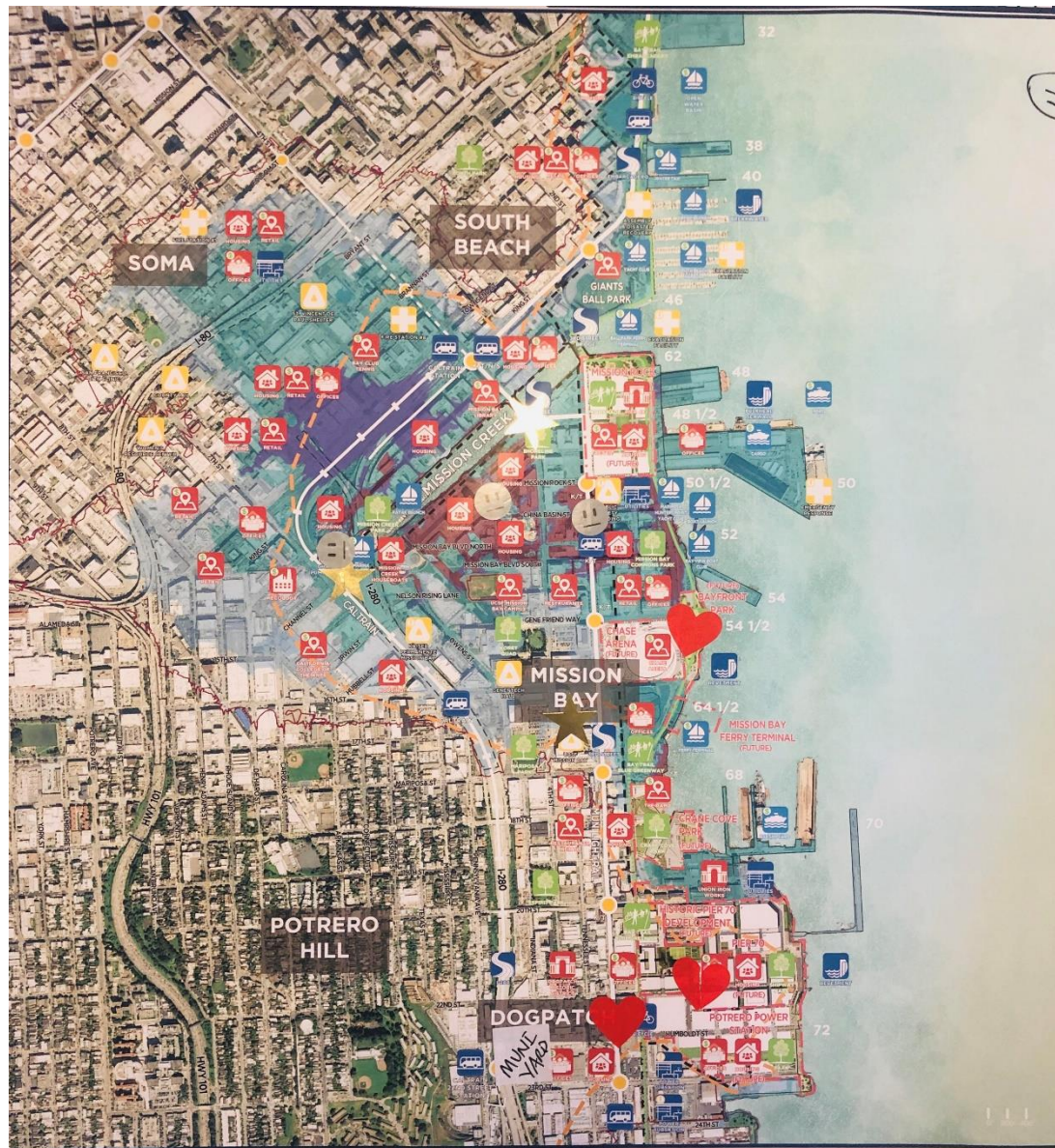
TABLE #4 GAMEBOARD