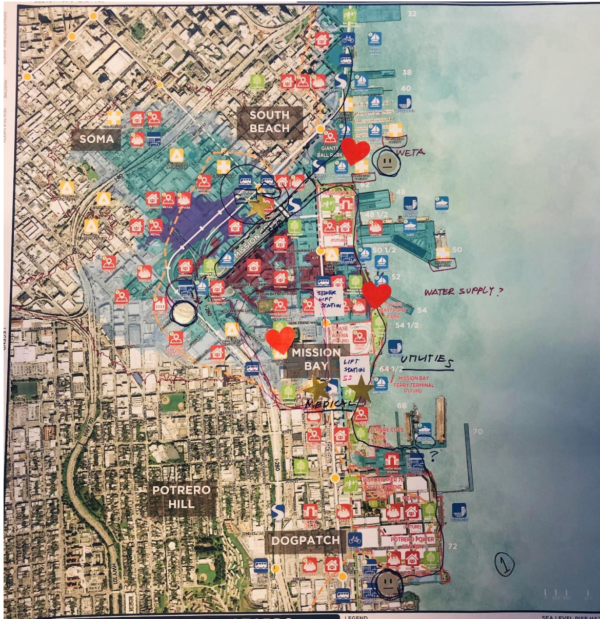
TABLE #1 GAMEBOARD