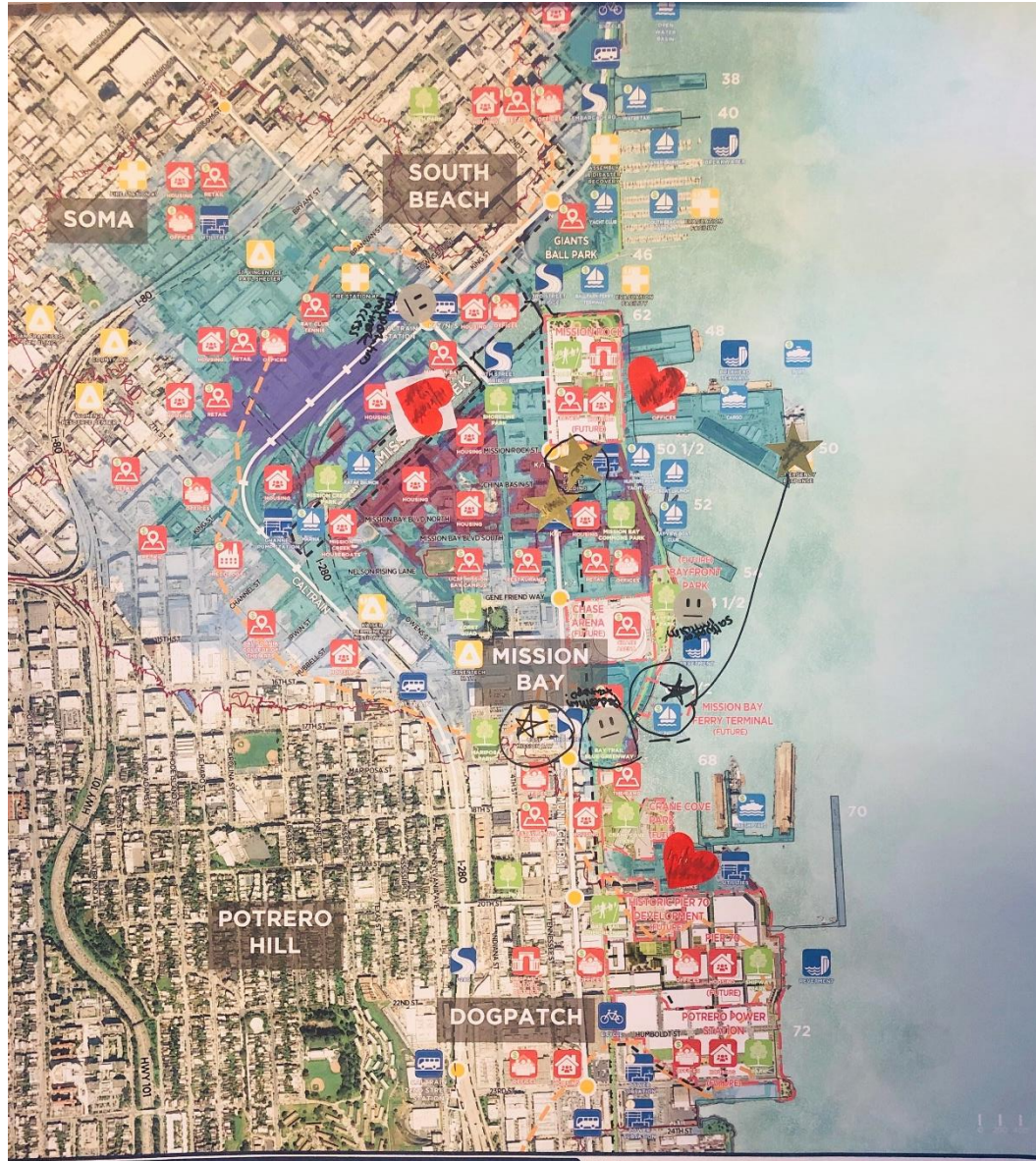
TABLE #5 GAMEBOARD