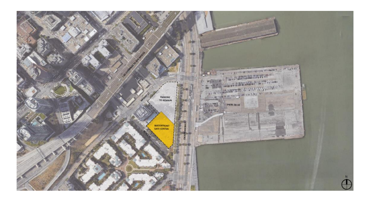
Figure 1: Proposed Location on Port Property

The proposed Embarcadero SAFE Navigation Center will occupy approximately 46,600 square feet of enclosed area including approximately 10,500 square feet of outdoor space for courtyards and circulation (approximately half the size of Seawall Lot 330). Figure 1 below shows the location of the proposed facility. Figure 2 shows a concept plan.