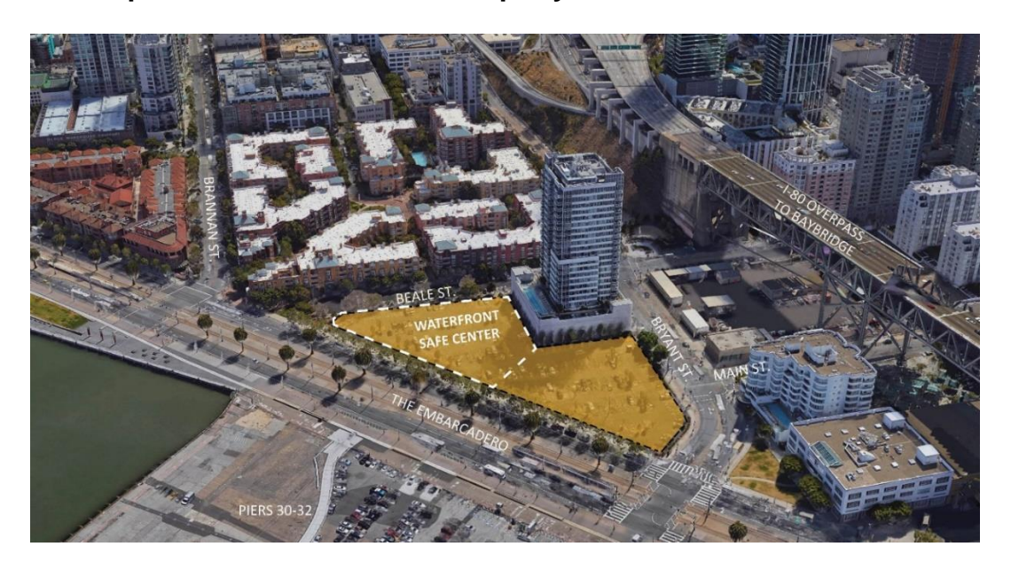
Figure 2: Proposed Building Layout