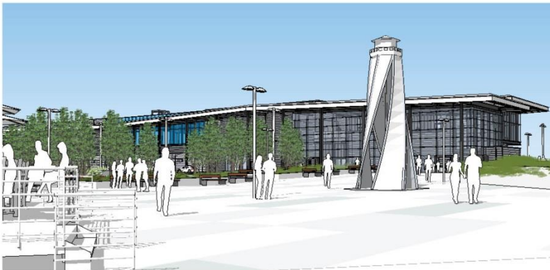
View of Haifa Sculpture from Embarcadero Promenade.

P:\Planning\Piers 27-31\Northeast Wharf\Graphics\Pier 27 Art Installation Plan\05.26.2017 Haifa-only Layout.indd