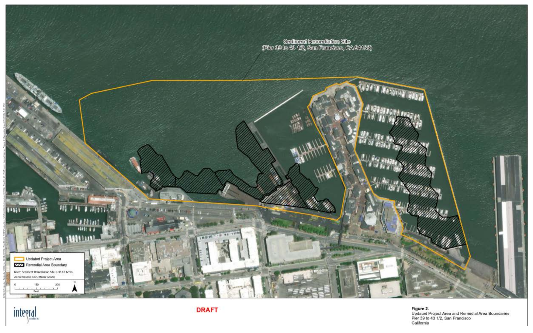
EXHIBIT A Project Site Plan