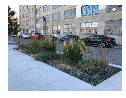
Understory plantings (Sitewide)