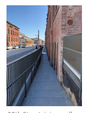
20th St. retaining wall fronting Bldg. 113