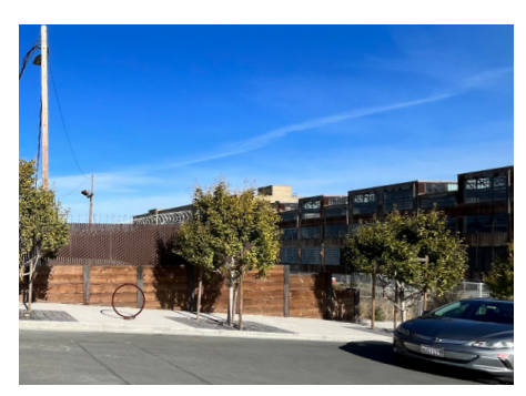
22nd retaining wall fronting Hoedown Yard