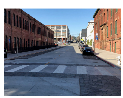
20th Street Context