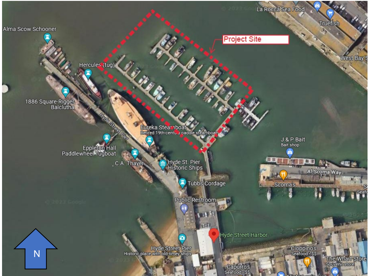
EXHIBIT A AREA OF WORK LOCATION MAP