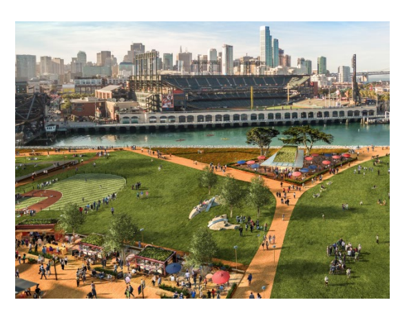
Figure 11: Rendering of a park in the planned Mission Rock development.

The development requires the construction of new horizontal infrastructure including streets, sidewalks, and utilities. The cost of these infrastructure enhancements will be ultimately paid by revenues generated by Port land value in the form of pre-paid leases and an Infrastructure Finance District to be established for this project. The development Phase 1 construction started in 2020 and will deliver four buildings and a five-acre park in 2024.