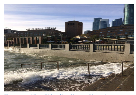
Figure 15: King Tides flooding at Pier 14

effort. The funding plan thus far has included a $425 million Seawall Earthquake Safety General Obligation Bond, which was overwhelmingly approved by voters in November 2018. In 2018, the U.S. Army Corps of Engineers (USACE) awarded the Port an appropriation to begin a general investigation of coastal flood risk along the Port's 7.5-mile waterfront. Additionally, in February 2019, the Port secured a $5 million appropriation from the State of California. In August 2020, the Port released a multi-hazard seismic and flood risk assessment of Port and City infrastructure along the Embarcadero Seawall which is being used as a guide to inform project planning. The City and the Port continue to seek other sources of revenue to fully fund the Waterfront Resiliency Program.