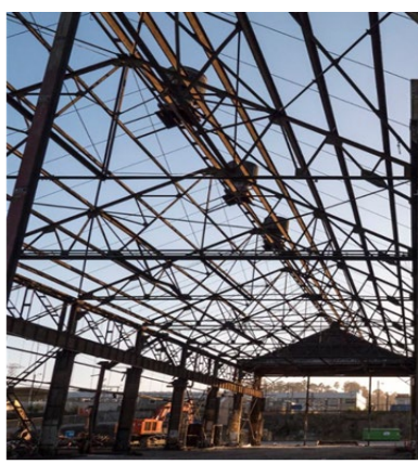
Figure 8: Pier 70 Structures

The one-time cost category primarily captures non-cyclical improvements, typically driven by changes in code requirements. It also includes the cost of demolition, when a facility, such as the Pier 90 grain silos, has been deemed no longer necessary to the Port and is removed from the renewal cycle. One-time work includes moving under-pier utilities above the pier, as well as rehabilitating a large number of the structures at Pier 70. As a result, the plan reflects these facilities as one-time costs for rehabilitation or demolition until they are fully improved, and a capital maintenance cycle commences.