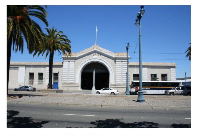
Figure 17: Pier 19 Bulkhead Building, a future RFP site.

Through the Embarcadero Historic Piers Request for Interest process, the Port identified additional sets of piers with development potential, Piers 19-23, 29-31, and Piers 26 and 28. Currently, the staff is awaiting further development of sea-level rise adaptation strategies (see the WRP section below) before it can issue an RFP for these development opportunities.