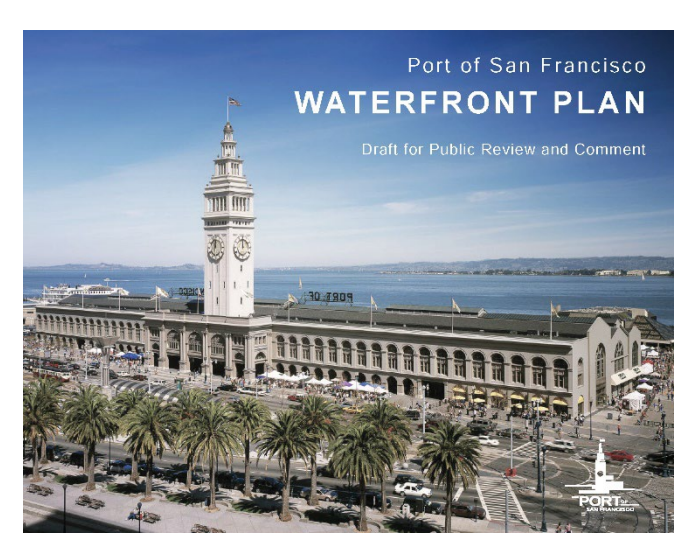
Figure 4: Draft Waterfront Plan

The Waterfront Plan, takes those challenges under consideration and creates policies that allow the high revenue-generating uses necessary to achieve a financially feasible project. These policies expand the tools