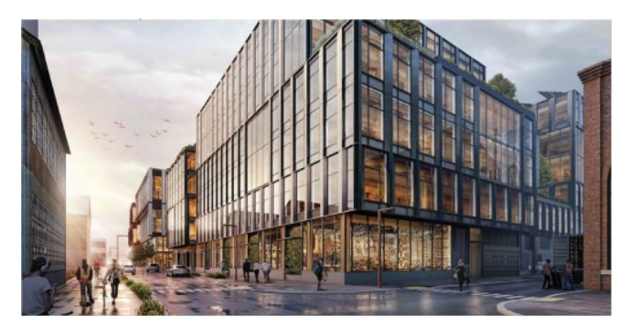
Figure 10: Pier 70 Renderings

Brookfield Properties is the Port's development partner for the Waterfront Site at Pier 70. Project construction started in 2018 and the full build-out is estimated to be completed in 10-15 years. The project includes 6.5 acres of waterfront parks, playgrounds, and recreation opportunities; new housing units (including 30% below market rate homes); restoration and reuse of currently deteriorating historic structures; new and renovated space for arts, cultural, small-scale manufacturing, local retail, and neighborhood services; up to 1.75