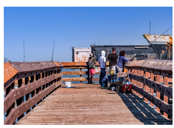
Figure 16: Agua Vista Fishing Pier

The Port of San Francisco, in partnership with the U.S. Army Corps of Engineers (USACE) and San Francisco city agencies, has drafted seven strategies based on over five years of public engagement which represent some combination of defending against, accommodating, or retreating from rising waters. These strategies are informed by the highly varied risks, topography, historical significance, and economic importance of each area of the waterfront. With the draft strategies now available for public feedback, the goal is to reach a preferred approach to reduce flood risks from sea level rise and extreme storms and provide an opportunity to invest in and bring public benefits to San Francisco's waterfront. More details are available at sfport.com/wrp/waterfront-adaptation.