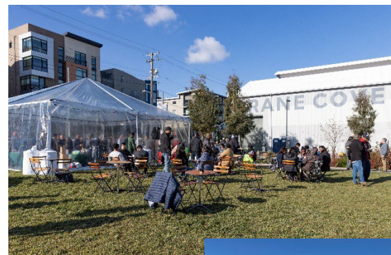
Figure 6: Crane Cove

Crane Cove Park is a new, approximately seven-acre, Blue Greenway waterfront park located in the Central Waterfront between 19th and Mariposa Streets east of Illinois Street. The park includes shoreline reconstruction including the creation of a beach and revetment, stabilization of historic gantry crane, use of shipyard relics as interpretive elements, bay access, green space with shade trees and seating, a waterfront walkway, and bicycle parking. The total cost for the entire project was $36.7 million and was funded by $25.9 million from the 2008 and 2012 Parks Bonds and $10.8 million in grants and Port sources. The park opened to the public on September 30, 2020. 19th and Georgia St construction and Building 49 core and shell retrofit and the permanent public restrooms were completed in July 2021.