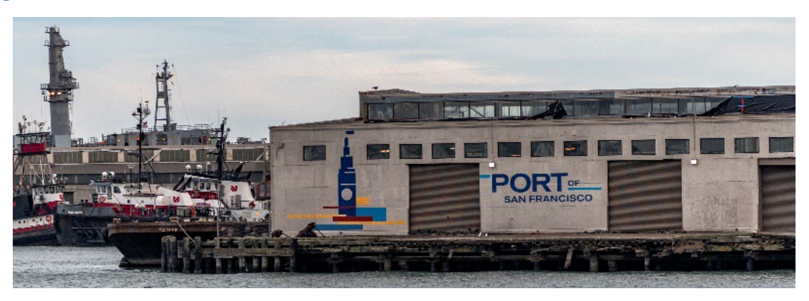
Figure 7: Pier 48 Shed

Consistent with the Port Commission's commitment to invest in Port assets, the Port maximizes its investment in the capital program given the scarce revenues available. This work maintains existing resources and, when possible, makes vacant properties fit for leasing to increase the Port's revenue-generating capacity. A substantial portion of the Port's facility renewal budget supports pier structure repairs to ensure: 1) the continued safe operation of pier superstructures and buildings; 2) the preservation and growth of lease revenues; and 3) the extension of the economic life of the Port's pier and marginal wharf assets.