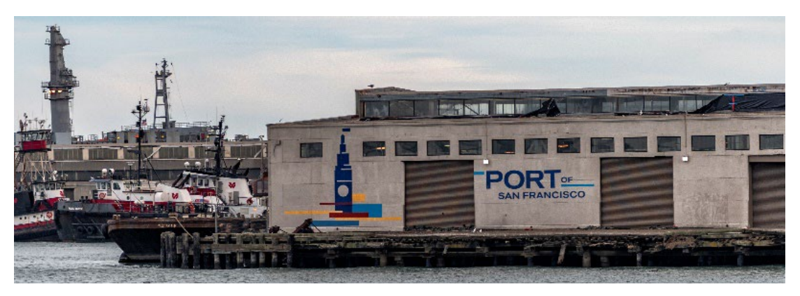
Figure 7: Pier 48 Shed

Consistent with the Port Commission's commitment to invest in Port assets, the Port maximizes its investment in capital program given the scarce revenues available. This work maintains existing resources and, when possible, makes vacant properties fit for leasing to increase the Port's revenue generating capacity. A substantial portion of the Port's facility renewal budget supports pier structure repairs to ensure: 1) the continued safe operation of pier superstructures and buildings; 2) the preservation and growth of lease revenues; and 3) the extension of the economic life of the Port's pier and marginal wharf assets.