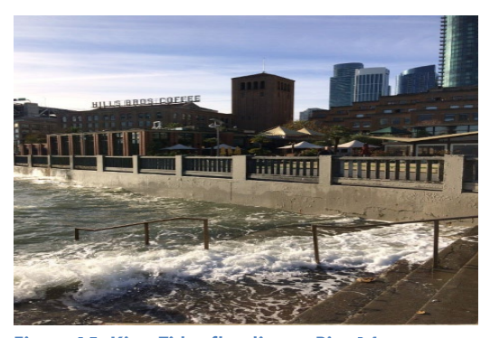
Figure 15: King Tides flooding at Pier 14

effort. The funding plan thus far has included a $425 million Seawall Earthquake Safety General Obligation Bond, which was overwhelmingly approved by voters in November 2018. In 2018, the U.S. Army Corps of Engineers (USACE) awarded the Port an appropriation to begin a general investigation of coastal flood risk along the Port's 7.5-mile waterfront. Additionally, in February 2019, the Port secured a $5 million appropriation from the State of California. In August 2020, the Port released a multi-hazard seismic and flood risk assessment of Port and City infrastructure along the Embarcadero Seawall which is being used as a guide to inform project planning. The City and the Port continue to seek other sources of revenue to fully fund the Waterfront Resiliency Program.