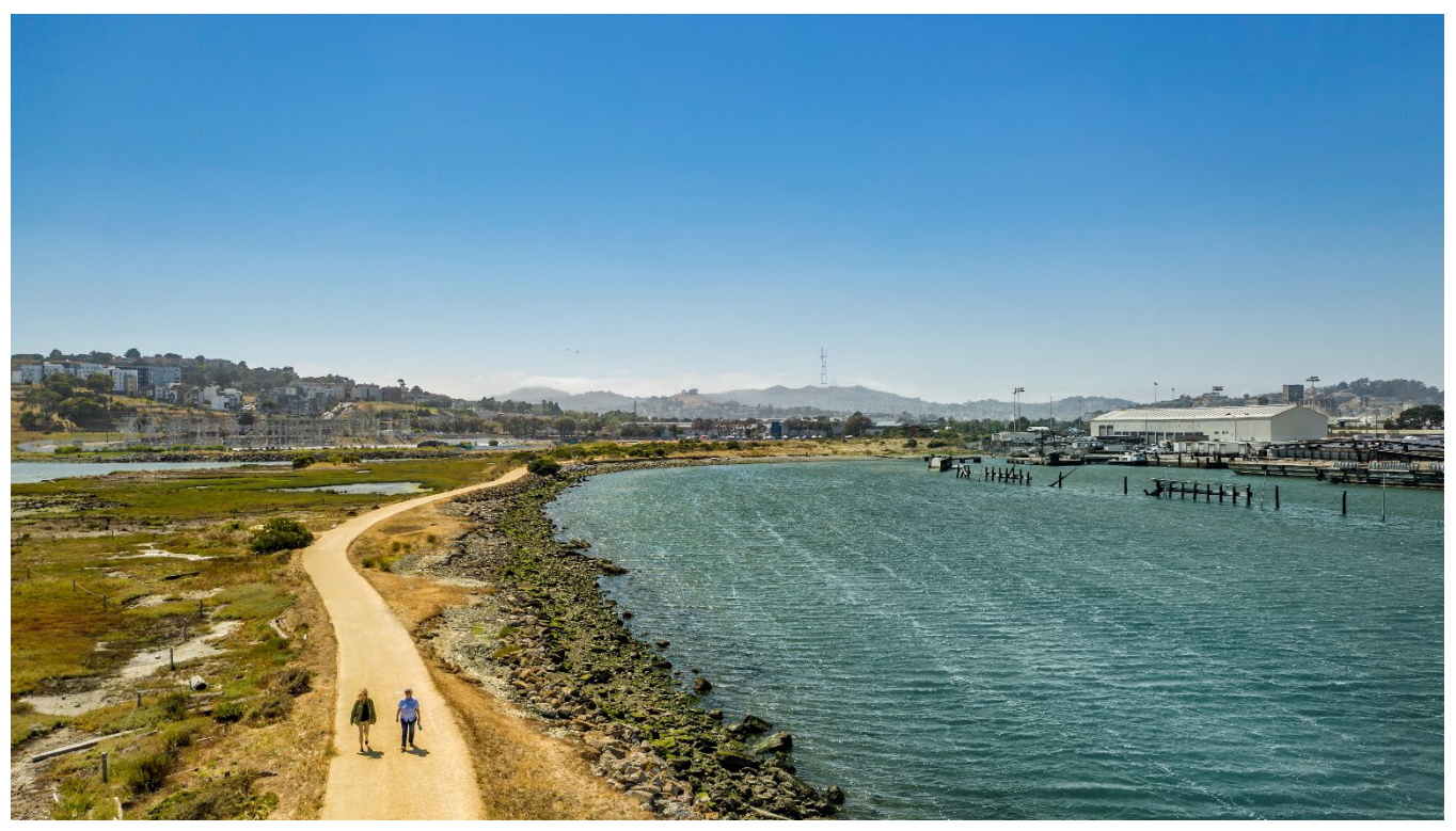
Figure 1: Heron's Head Park

addressing the full extent of the Port's capital need still requires significant external funds which have yet to be identified.