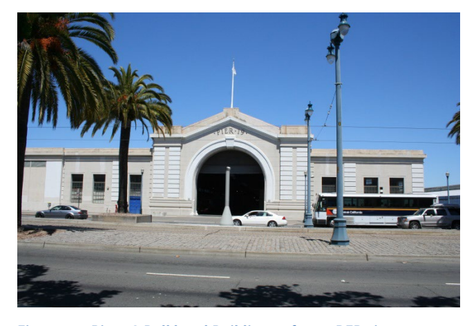
Figure 17: Pier 19 Bulkhead Building, a future RFP site.

Through the Embarcadero Historic Piers Request for Interest process, the Port identified additional sets of piers with development potential, Piers 19-23, 29-31 and Piers 26 and 28. Currently staff is awaiting further development of sea-level rise adaptation strategies (see the WRP section below) before it can issue an RFP for these development opportunities.