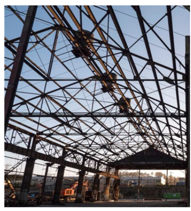
Figure 8: Pier 70 Structures

The one-time cost category primarily captures non-cyclical improvements, typically driven by changes in code requirements. It also includes the cost of demolition, when a facility, such as the Pier 90 grain silos, has been deemed no longer necessary to the Port and is removed from the renewal cycle. One-time work includes moving under-pier utilities above the pier, as well as rehabilitating a large number of the structures at Pier 70. As a result, the plan reflects these facilities as one-time costs for rehabilitation or demolition until they are fully improved, and a capital maintenance cycle commences.