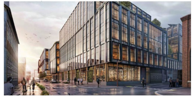
Figure 10: Pier 70 Renderings

Brookfield Properties is the Port's development partner for the Waterfront Site at Pier 70. Project construction started in 2018 and the full build-out estimated to be completed in 10-15 years. The project includes 6.5 acres of waterfront parks, playgrounds and recreation opportunities; new housing units (including 30% below market-rate homes); restoration and reuse of currently deteriorating historic structures; new and renovated space for arts, cultural, small-scale manufacturing, local retail, and neighborhood services; up to 1.75