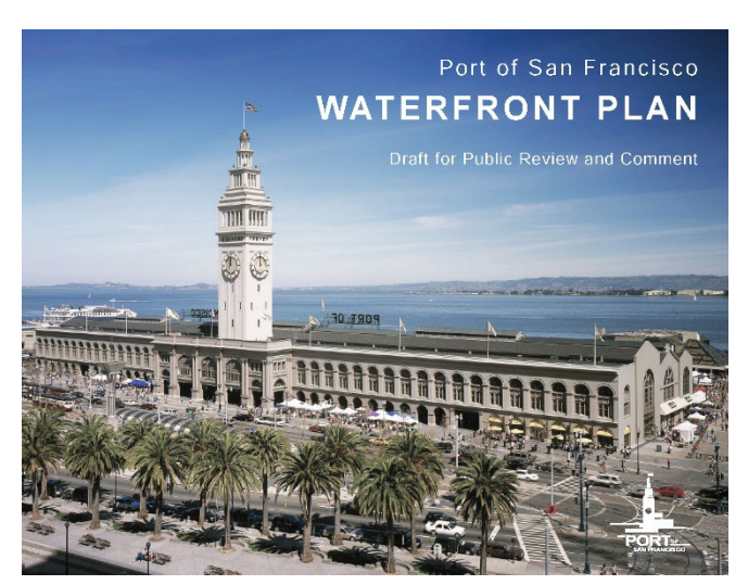
Figure 4: Draft Waterfront Plan

The Waterfront Plan, takes those challenges under consideration and creates policies which allow the high revenue generating uses necessary to achieve a financially feasible project. These policies expand the tools