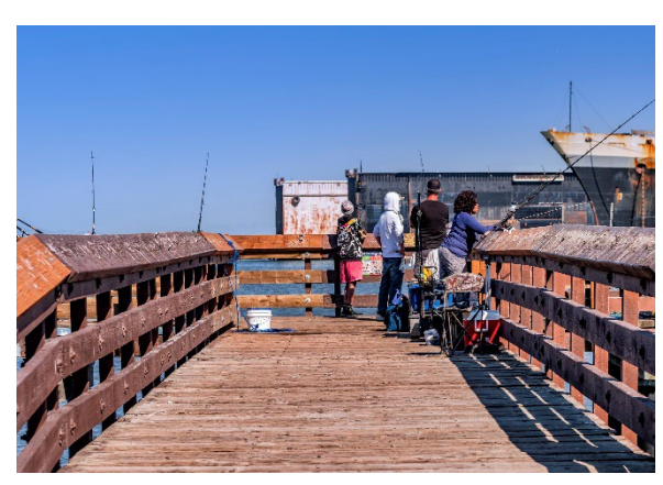
Figure 16: Agua Vista Fishing Pier

The Port of San Francisco, in partnership with the U.S. Army Corps of Engineers (USACE) and San Francisco city agencies, has drafted seven strategies based on over five years of public engagement which represent some combination defending against, accommodating, or retreating from rising waters. These strategies are informed by the highly varied risks, topography, historical significance, and economic importance of each area of the waterfront. With the draft strategies now available for public feedback, the goal is to reach a preferred approach to reduce flood risks from sea level rise and extreme storms and provide an opportunity to invest in and bring public benefits to San Francisco's waterfront. More details are available at sfport.com/wrp/waterfront-adaptation.