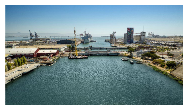
Figure 13: Islais Creek

San Francisco faces coastal flood risks today. Port property including low lying areas of the Embarcadero Promenade currently experience flooding during annual high tides. Other property such as Mission Creek, Islais Creek, and Heron's Head Park are at low elevations and are subject to flood risk today with a 100-year storm event. In 2016, the National Historic Trust identified the Embarcadero Historic District as one of the 11 most endangered historic places in the country, due to the threats of rising sea levels and seismic vulnerability.