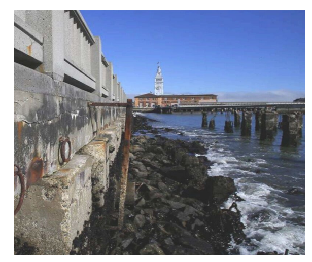
Figure 14: The Embarcadero Seawall south of the historic and iconic San Francisco Ferry Building.

The Waterfront Resilience Program (WRP) is a major City and Port effort to improve the Port's 7.5-mile shoreline to provide increased seismic performance, provide near-term flood protection improvements, and plan for long-term resilience and sea-level rise adaptation. In 2018, the Port estimated that the cost of this work for the approximately 3.5 miles of the Embarcadero area was $5 billion. The Port is now developing updated estimates of these costs for the entire waterfront. The Port will implement the WRP over several decades and will require federal, state, and local permitting and funding to