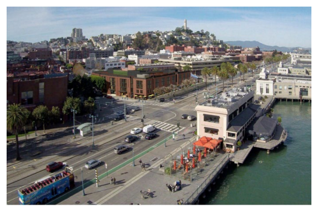
Figure 12: Rendering of the proposed hotel-dinner-theater development on SWLs 323 & 324

on September 10, 2019 the Port Commission approved Lease Disposition and Development Agreement (LDDA) with TZK Broadway, LLC to improve Port-owned vacant land parcel (consisting of Seawall Lots 323/324 and the nearby street stubs) with a mixed-use development. This proposed development is planned to include the following: a four-story building with a 192-room hotel, a dinner-theater space featuring the historic "Spiegeltent", and a \sim 14,000 -square-foot privately financed public park. Teatro ZinZanni will operate the dinner-theater. COVID-19 disruption has caused a two-year delay in the implementation timeline and it is now anticipated