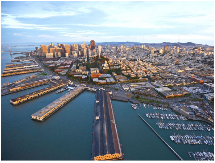
Figure 2: Aerial View of Northern Waterfront

The Port's waterfront has played an important role in San Francisco's development since the 1850's. The bulkhead buildings and finger piers along The Embarcadero, the shipyard warehouses and facilities at Pier 70, and other Port waterfront landmarks served to support a growing City and handled maritime commerce for decades. With changes in cargo and shipping, the historic facilities can no longer be used for cargo and ship building but are defining features of the unique San Francisco urban form and provide a network of important public places.