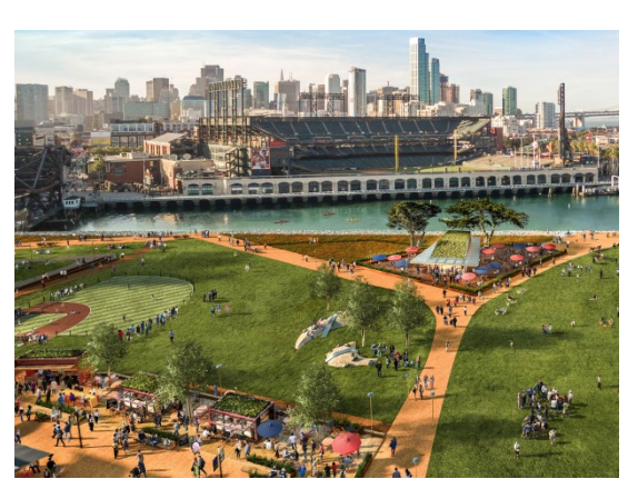
Figure 11: Rendering of a park in the planned Mission Rock development.

The development requires construction of new horizontal infrastructure including streets, sidewalks, and utilities. The cost of these infrastructure enhancements will be ultimately paid by revenues generated by Port land value in the form of pre-paid leases and an Infrastructure Finance District to be established for this project. The development Phase 1 construction started 2020 and will deliver four buildings and a five-acre park in 2024.