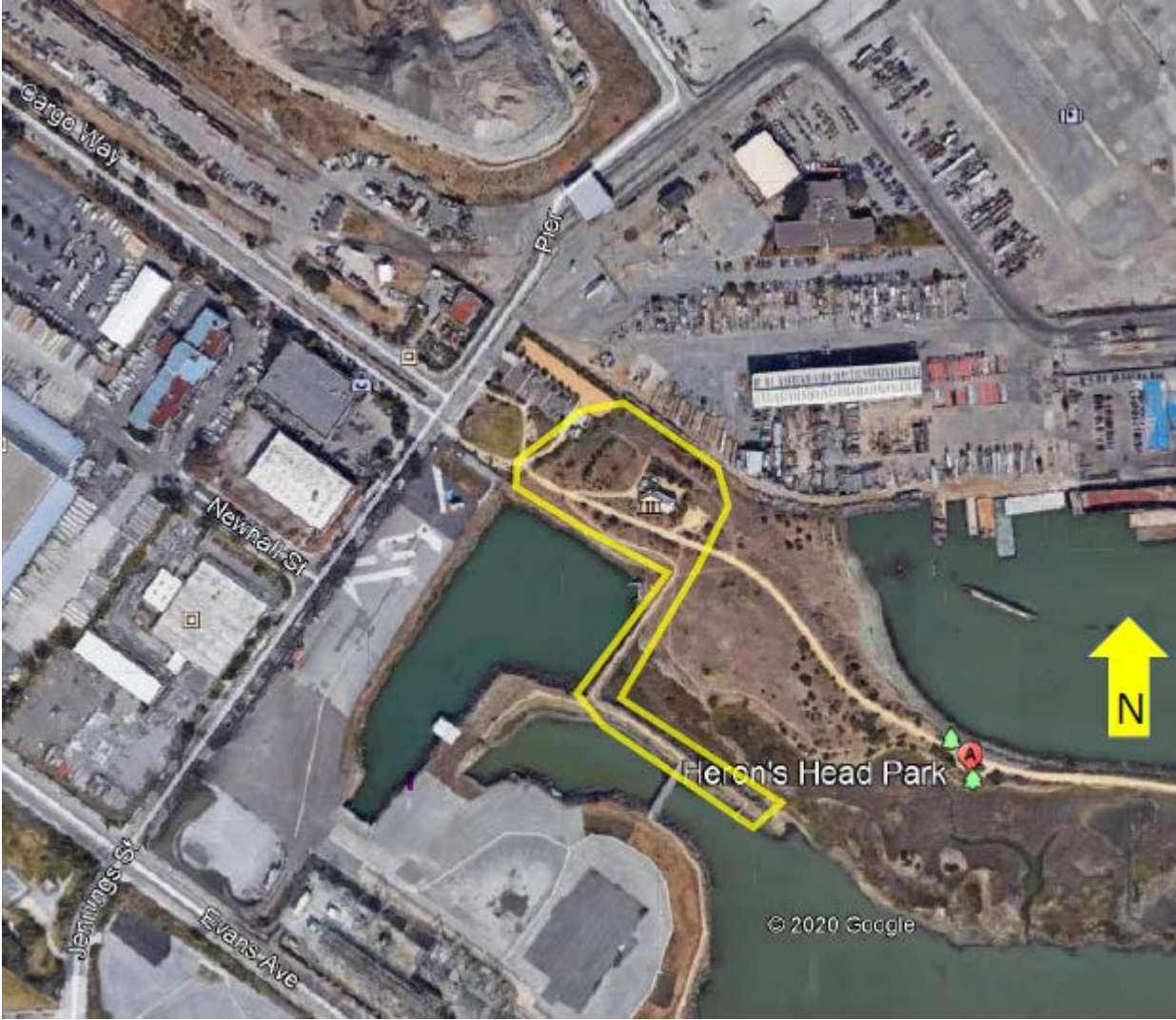
EXHIBIT A AREA OF WORK LOCATION MAP