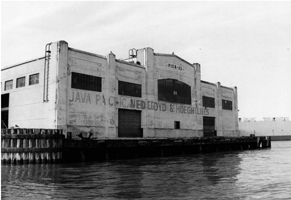
Photo 8. Pier 23, outshore end, view north; Port of San Francisco Embarcadero Historic District. Roll BRV-5, Negative 5.