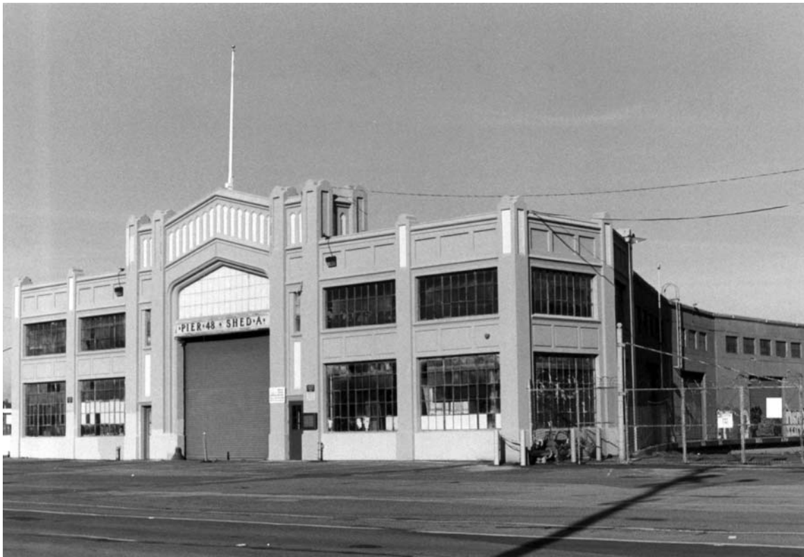
Photo 20. Pier 48, Shed A: In shore perspective, view northeast; Port of San Francisco Embarcadero Historic District. Roll BRV-4, Negative 13A.