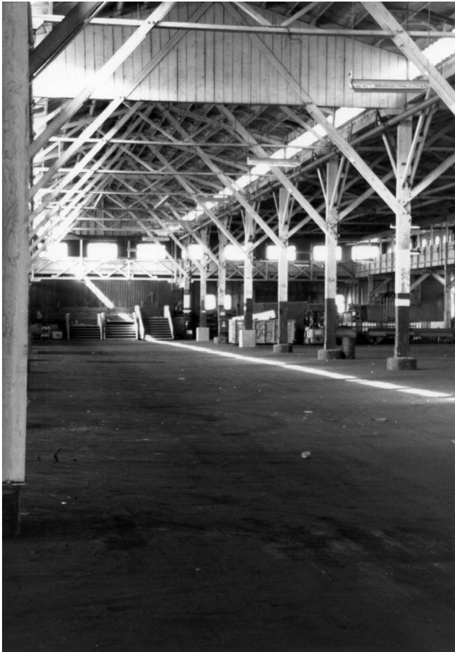
Photo 4. Pier 35, interior; Port of San Francisco Embarcadero Historic District. View northeast. Roll MRC-1, Negative 9.