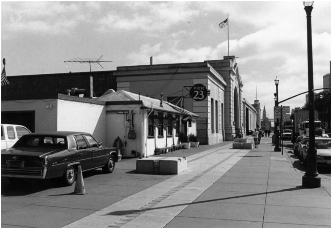
Photo 7. Pier 23 Restaurant, Pier 23, Pier 19, Ferry Building: Embarcadero facades, view southeast; Port of San Francisco Embarcadero Historic District. Roll BRV-2, Negative 6.