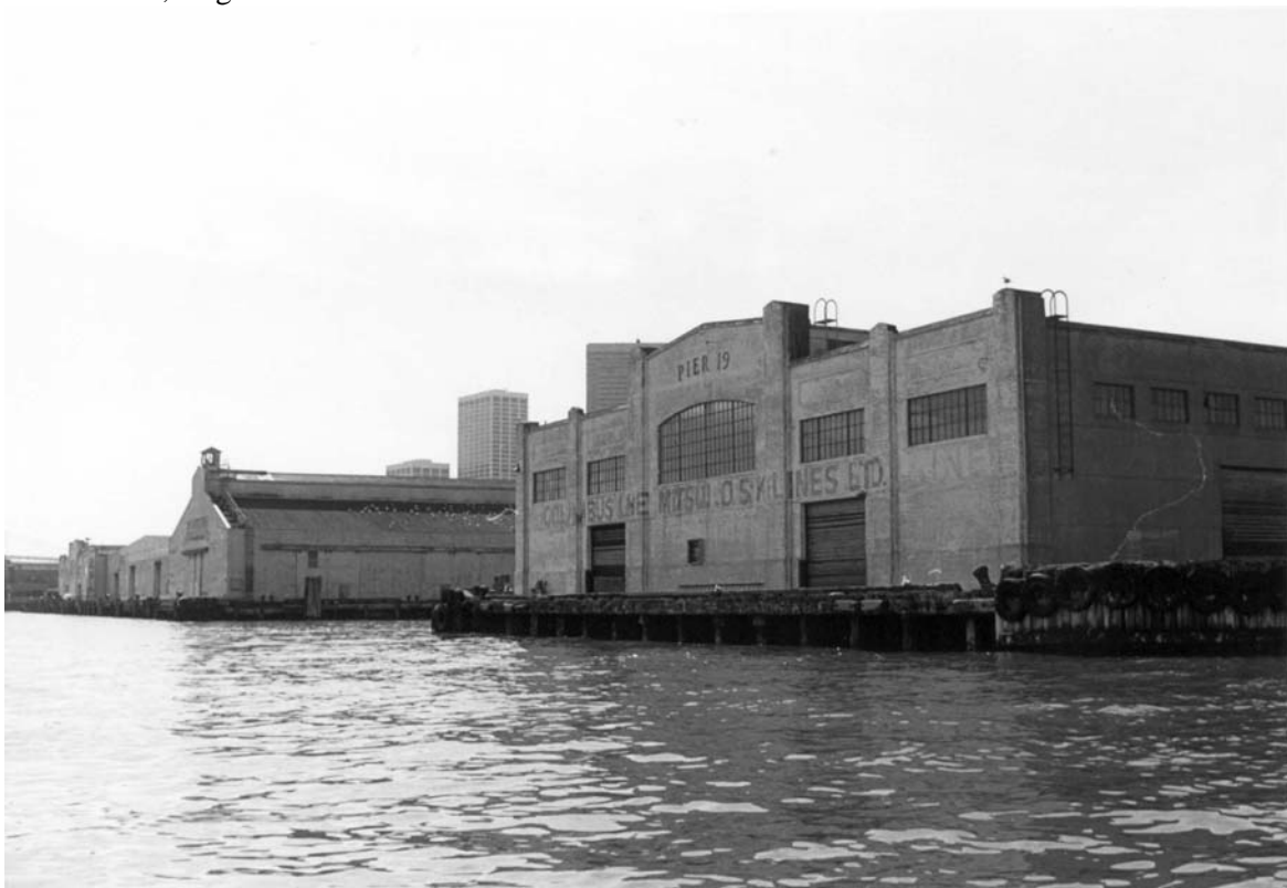
Photo 10. Piers 19, 17, 15 and 9: outshore ends, view south; Port of San Francisco Embarcadero Historic District. Roll BRV-5, Negative 8.