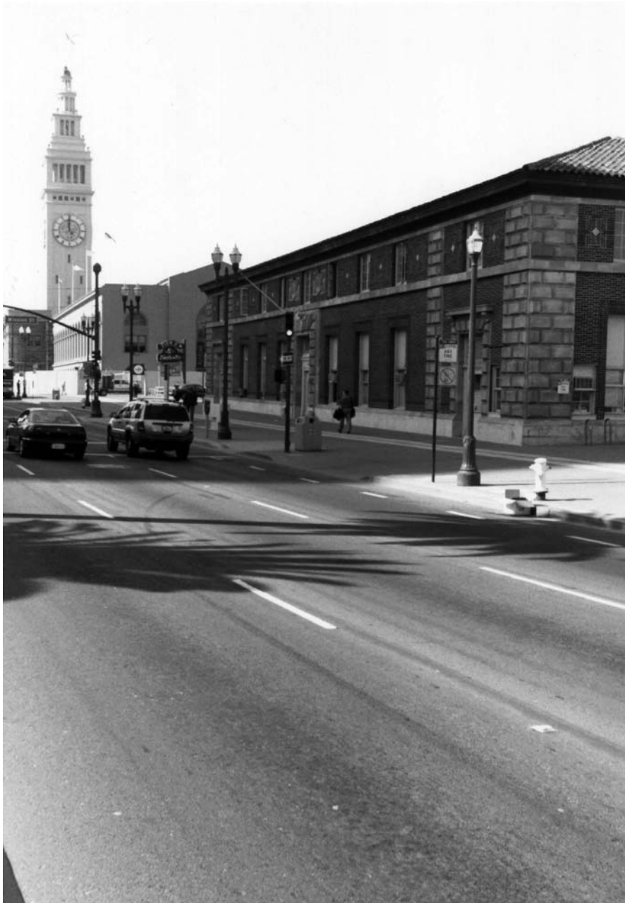
Photo 15. Agriculture Building and Ferry Building: Embarcadero facades, view north; Port of San Francisco Embarcadero Historic District. Roll MRC-1, Negative 13.