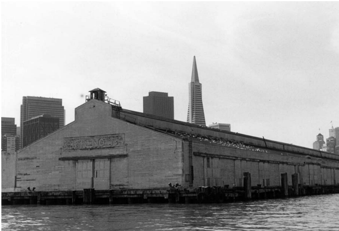
Photo 11. Pier 17; outshore perspective, view south; Port of San Francisco Embarcadero Historic District. Roll BRV-5, Negative 10.