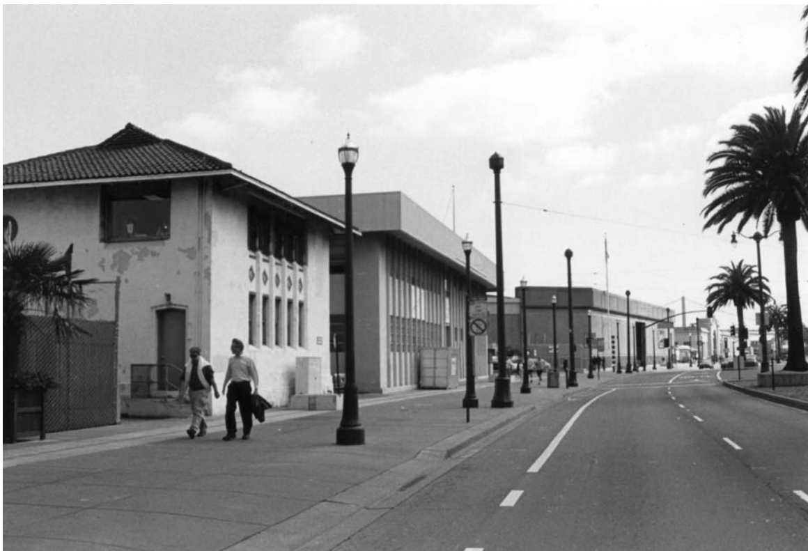
Photo 6. Pier 29 Annex, office Building Pier 29, Pier 27: Embarcadero facades, view southeast; Port of San Francisco Embarcadero Historic District. Roll BRV-2, Negative 4.