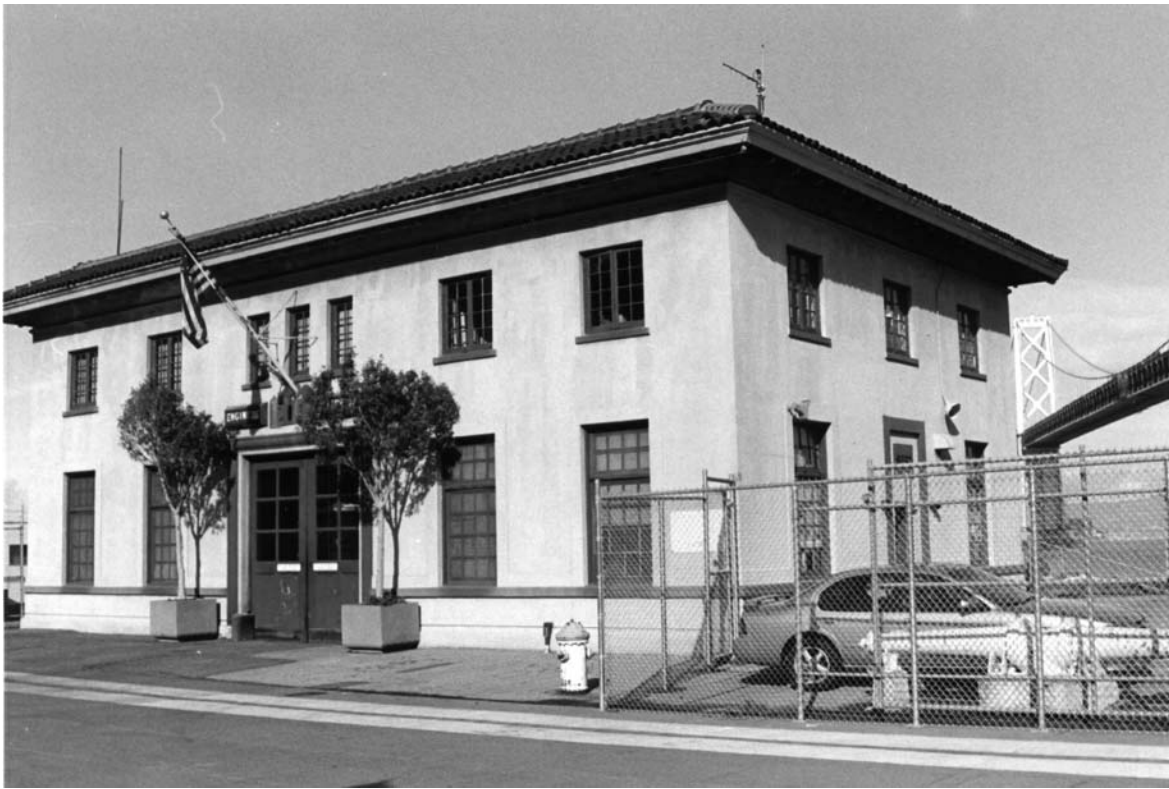
Photo 16. Pier 22 ½: Embarcadero façade, view northeast; Port of San Francisco Embarcadero Historic District. Roll BRV-3, Negative 12.