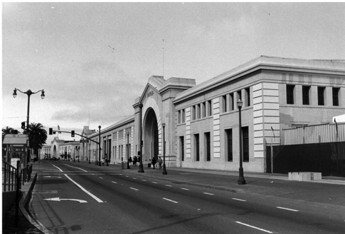
Photo 3. Pier 29, 31, and 33: Embarcadero facades, view north; Port of San Francisco Embarcadero Historic District. Roll BRV-2, Negative 3.