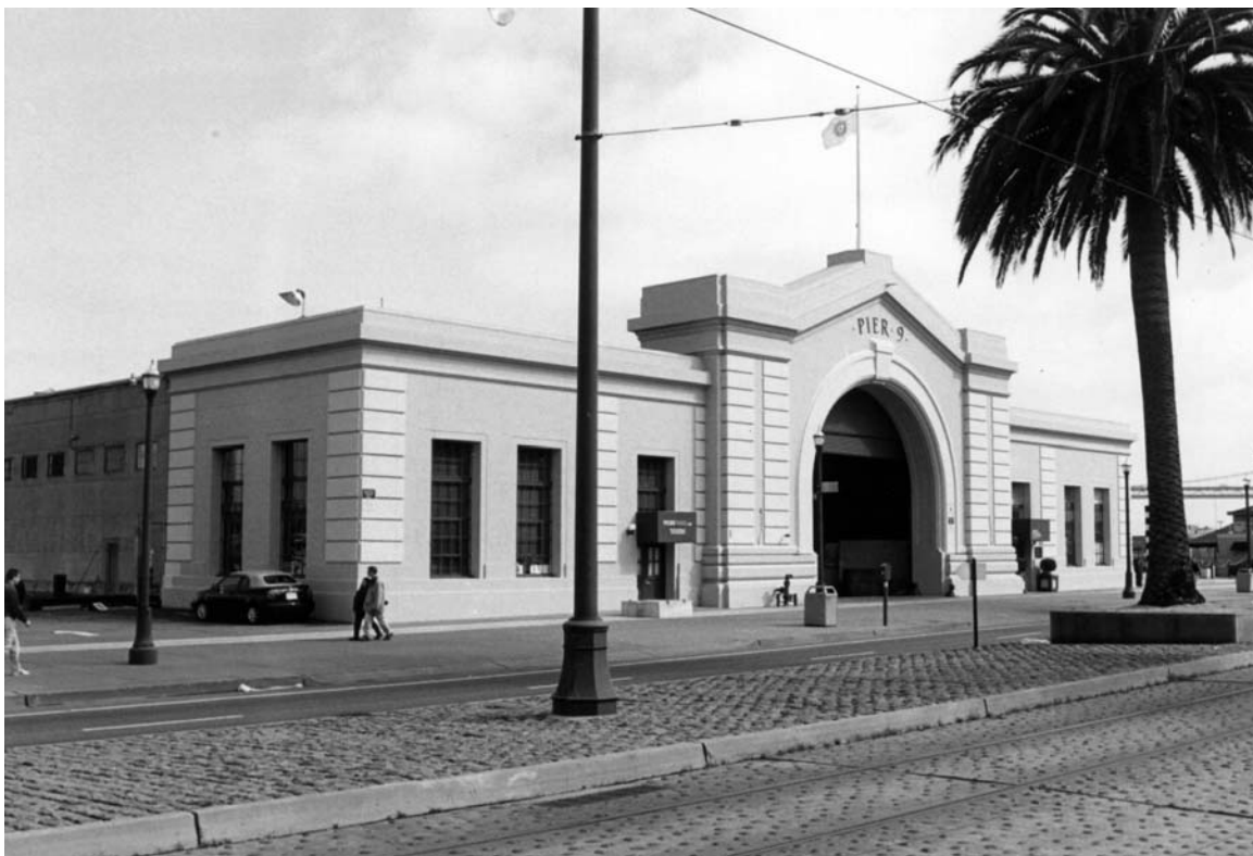
Photo 12. Pier 9 bulkhead building: Embarcadero façade, view east; Port of San Francisco Embarcadero Historic District. Roll BRV-2, Negative 20.