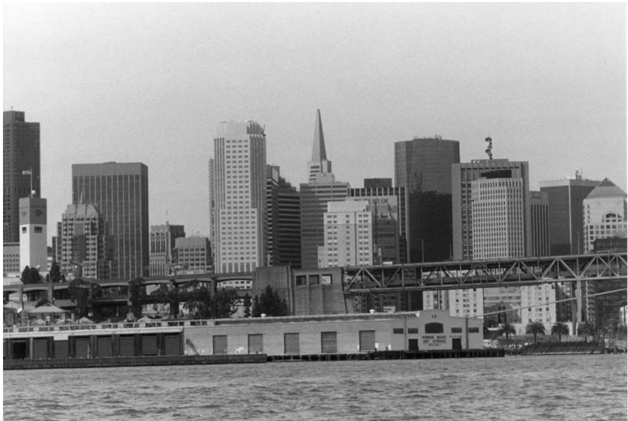
Photo 1. Overview of the Port of San Francisco with view of the city in the background, view northwest; Port of San Francisco Embarcadero Historic District. Roll BRV-7, Negative 18A.

All photographs were taken by Brian Vahey during February 2002, except for Photo 3 and Photo 13, which were taken by Michael Corbett in September 2002.