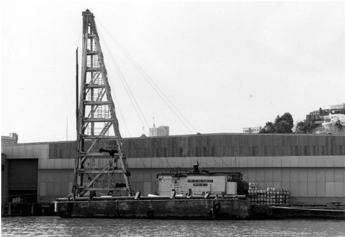
Photo 9. Pile Driving Rig No. 3: berthed at Pier 23; Port of San Francisco Embarcadero Historic District. Roll BRV-5, Negative 6.