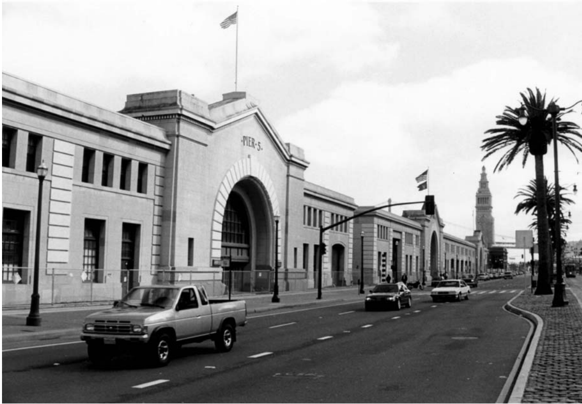
Photo 13. Piers 5 and 3, Ferry Building: Embarcadero facades, view southeast; Port of San Francisco Embarcadero Historic District. Roll BRV-2, Negative 28.