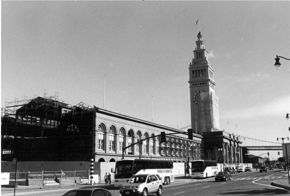
Photo 14. Ferry Building work in progress: Embarcadero perspective, view southeast; Port of San Francisco Embarcadero Historic District. Roll BRV-3, Negative 4.