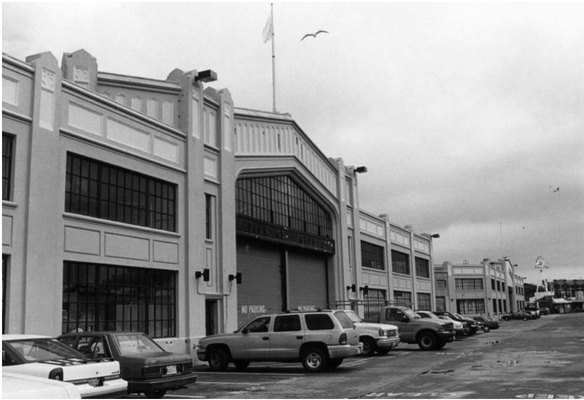
Photo 2. Pier 45, Sheds A and B: Embarcadero facades, view east; Port of San Francisco Embarcadero Historic District. Roll BRV-1, Negative 4.