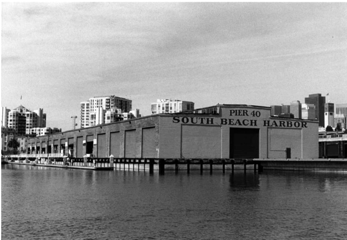
Photo 19. Pier 40; outshore perspective, view northwest; Port of San Francisco Embarcadero Historic District. Roll BRV-6, Negative 18.