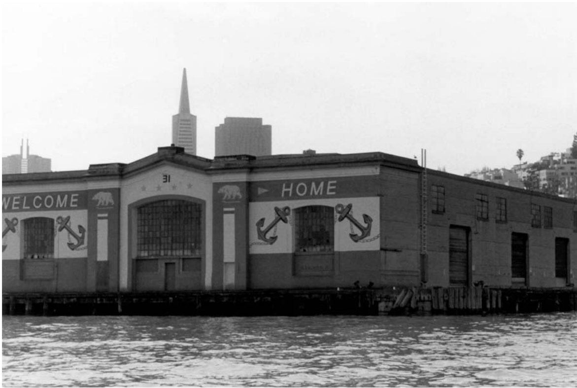
Photo 5. Pier 31, outshore end, view south; Port of San Francisco Embarcadero Historic District. Roll BRV-4, Negative 27A.