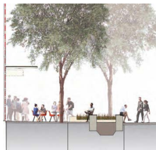
Detail Elevation view of street room from Mission Rock Design Controls