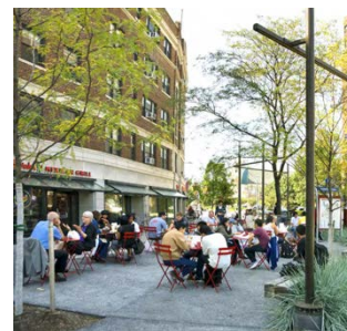
Precedent image of Street Room from Mission Rock Design Controls

As the design process unfolded, the Developer (in close consultation with Port Staff) sought to push the designs of the Street Rooms further than they had been initially conceived in the Design Controls to maximize their potential to contribute to Mission Rock’s unique identity and sense of place. Taking inspiration from parklets and similar tactical installations across San Francisco, Mission Rock Partners hosted a design competition soliciting concepts for Street Room installations at Mission Rock. The solicitation and selection processes were inclusive, and Port Staff were involved throughout.