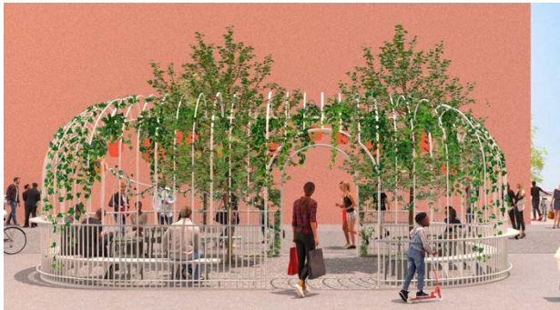
Garden Party – Min Design