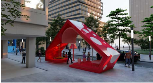
Lounge - 100 Architects