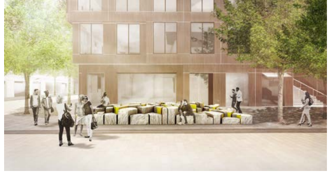
Pop Rocks – Terrain Work (Partially funded via the public art budget)