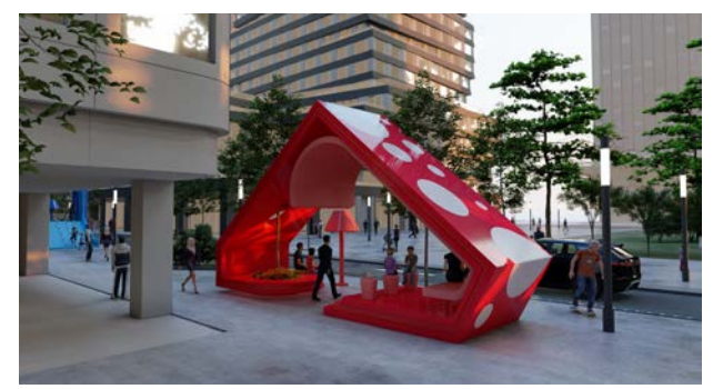
Lounge - 100 Architects