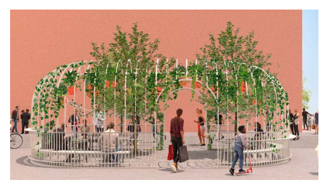
Garden Party – Min Design