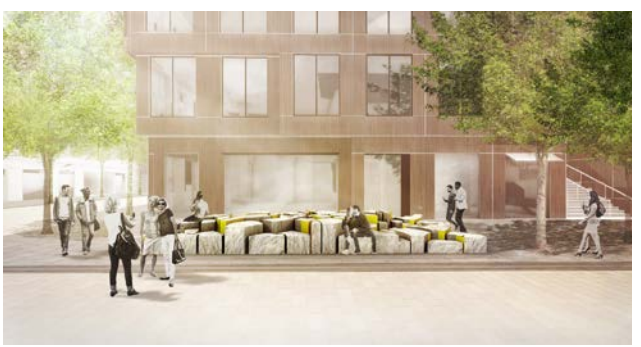
Pop Rocks – Terrain Work (Partially funded via the public art budget)