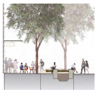
Detail Elevation view of street room from Mission Rock Design Controls