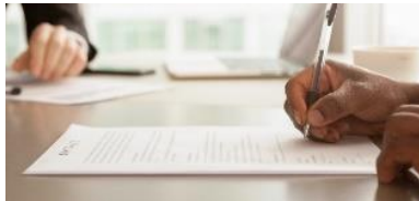
Acquisitions and Relocations