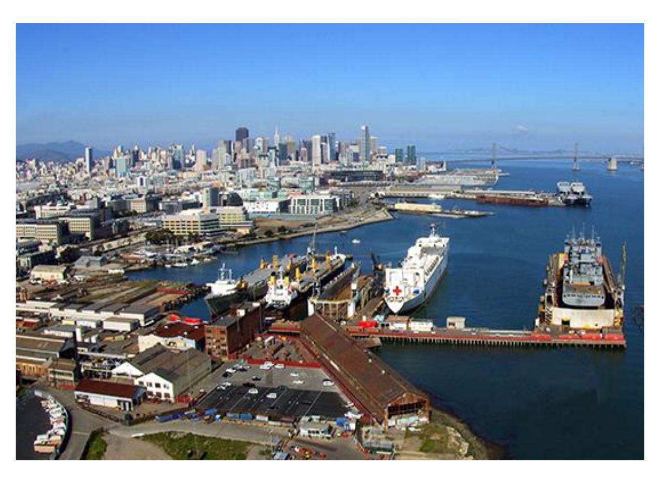
Port of San Francisco Issues Enhanced Shipyard RFP