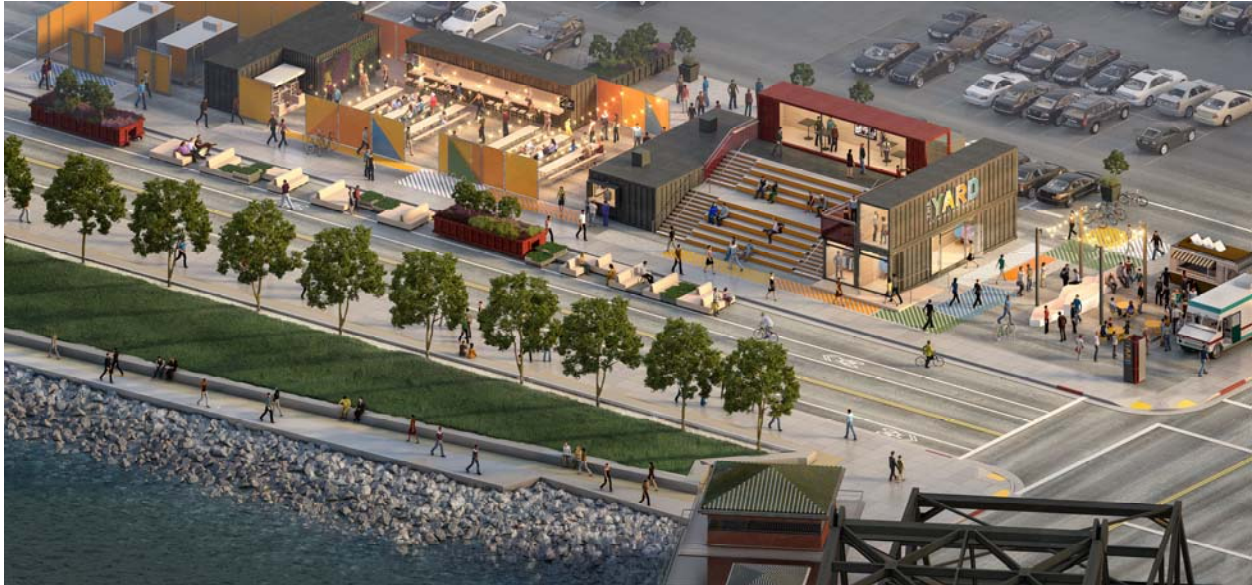
Artistic rendering looking southeast from Lefty O'Doul Bridge

The Yard will include four distinct areas: